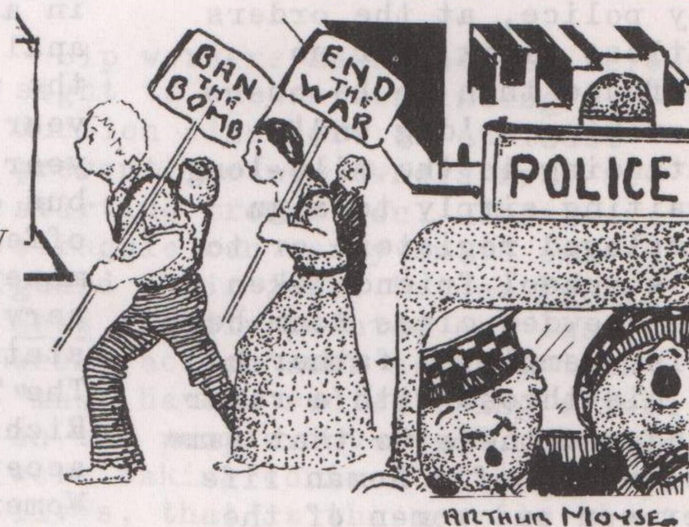
HAVE YOU NOTICED HOW YOUNG THE DEMONSTRATORS ARE GETTING?

The French authorities obviously thought that a massive show of strength against the work-in was the best means of ending what was fast becoming a very large thorn in their flesh. From the first reaction to the raid there has been considerable display of solidarity and support from other sections of workers and the population. This, unfortunately, might only be for brief periods and not long enough to force the government to change its plans. One-hour sympathy strikes by railwaymen and stoppages of Social Security services have taken place, but the Communist-led