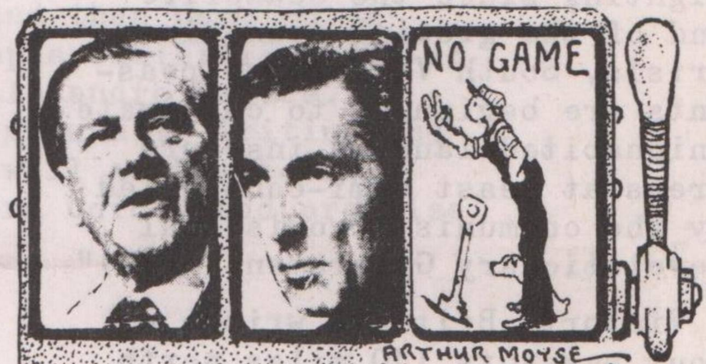
WE'VE PICKED THE USUAL LEMON