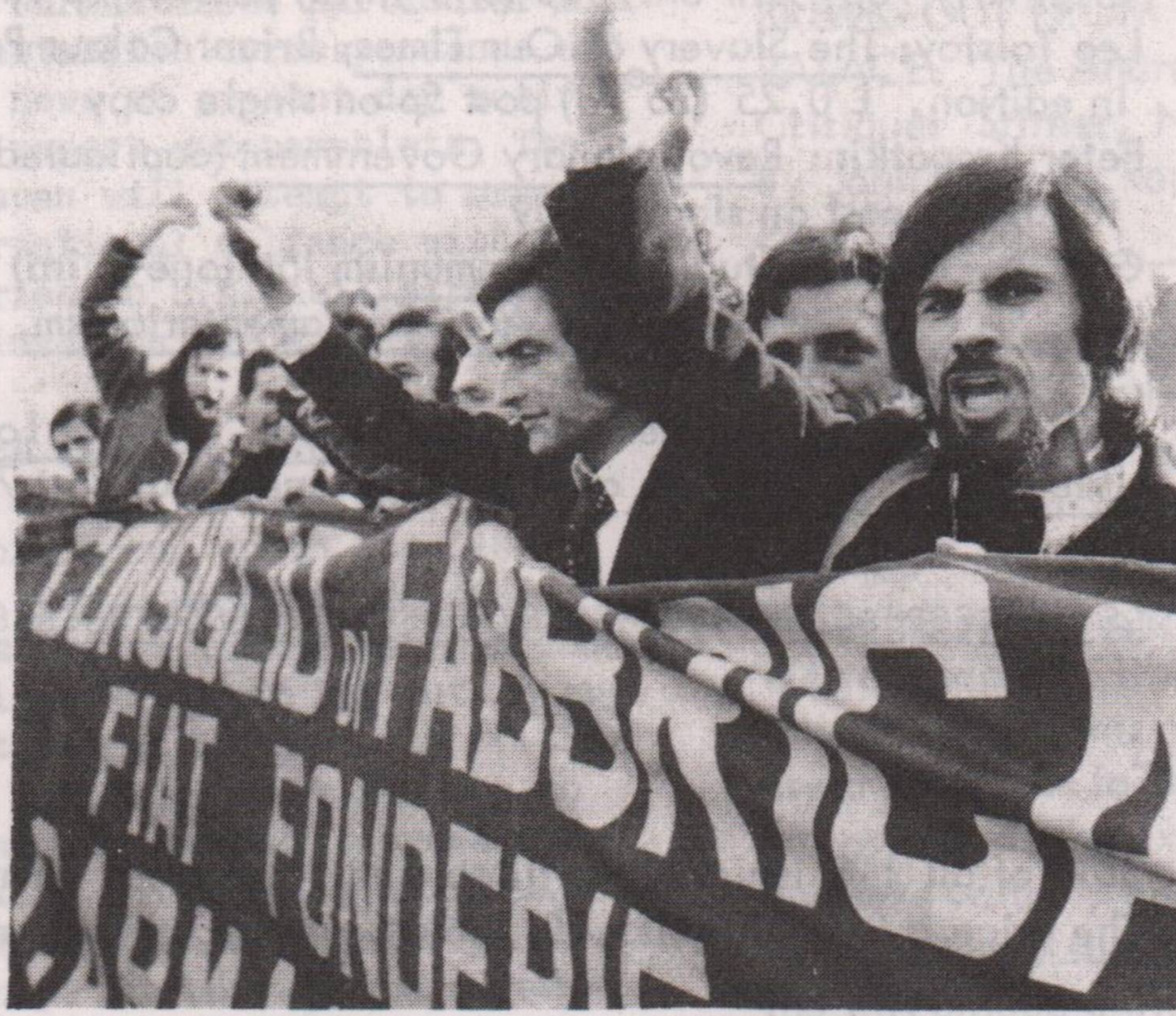
FIAT Workers Demonstrating

ITALY HAS been plunged into so many economic and financial crises since the war that one has lost count. Now, according to the press, Italy has become the weakest partner in the new enlarged Common Market and its inability to solve these problems is shaking the foundations of the E.E.C. The country needs a massive loan of capital from the International Monetary Fund but the terms on which this money could be given were not acceptable to the trade unions and to the different parties making up the Christian Democrat and Socialist coalition. The terms were the usual list of higher taxes and credit restrictions which would bring a recession from which the working class would obviously be the sufferers.