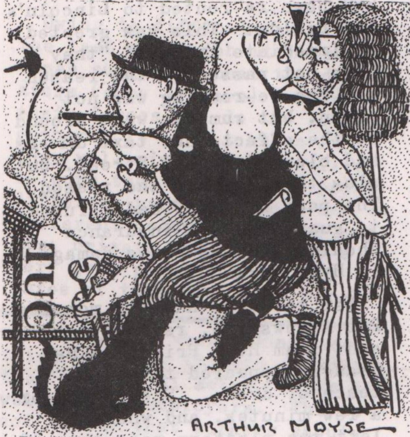
A WORKER SIGNING THE SOCIAL CONTRACT

What the "Social Contract" means is a restriction on wage increases in a period when inflation is expected to reach