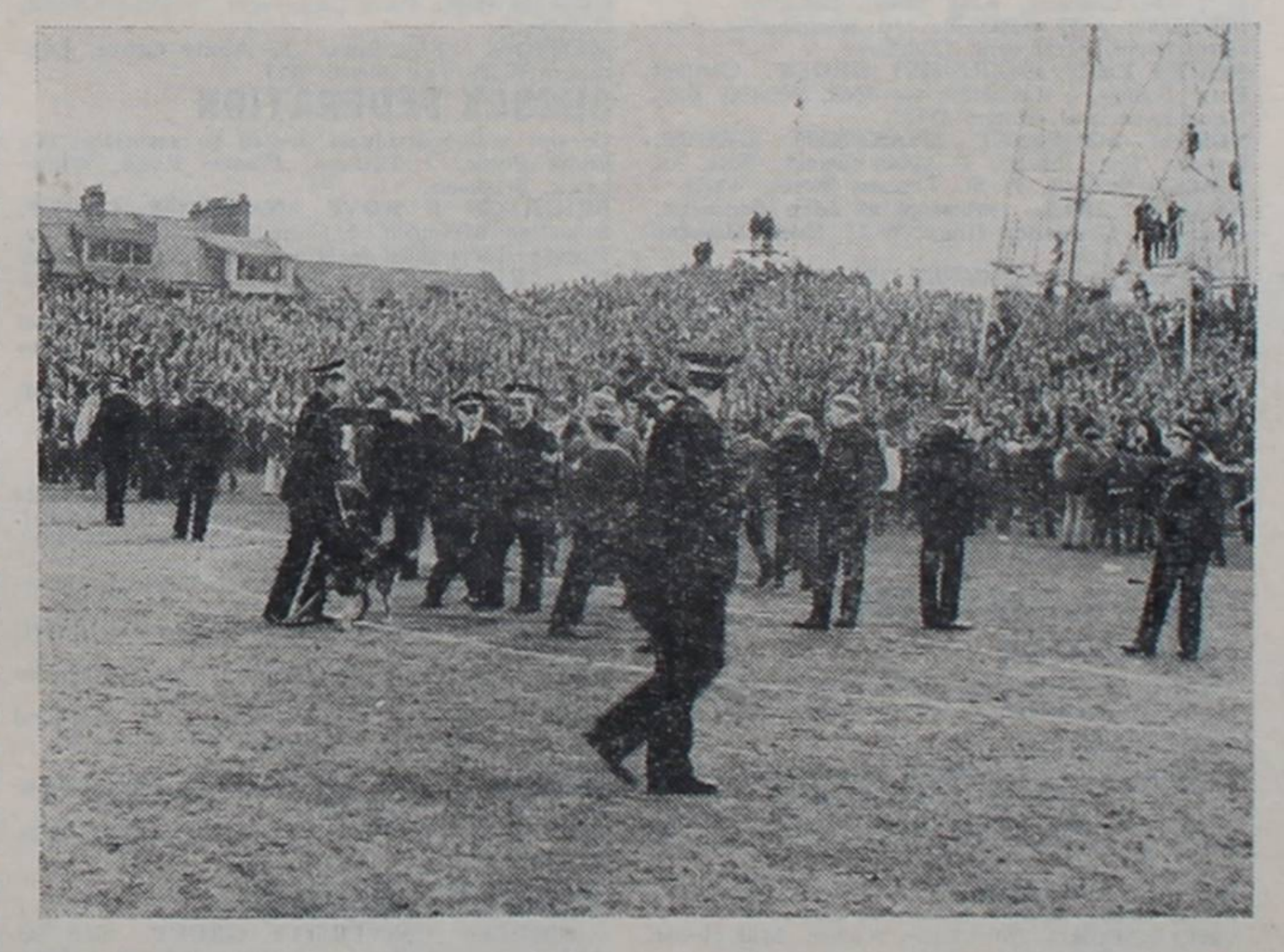
Who's Got the Ball?

Youth Centre in late 1967 and the swimming pool in 1968. So far no public houses have appeared, although two are under construction at the moment. There are no cafés, although one existed a few years ago but this was closed down by