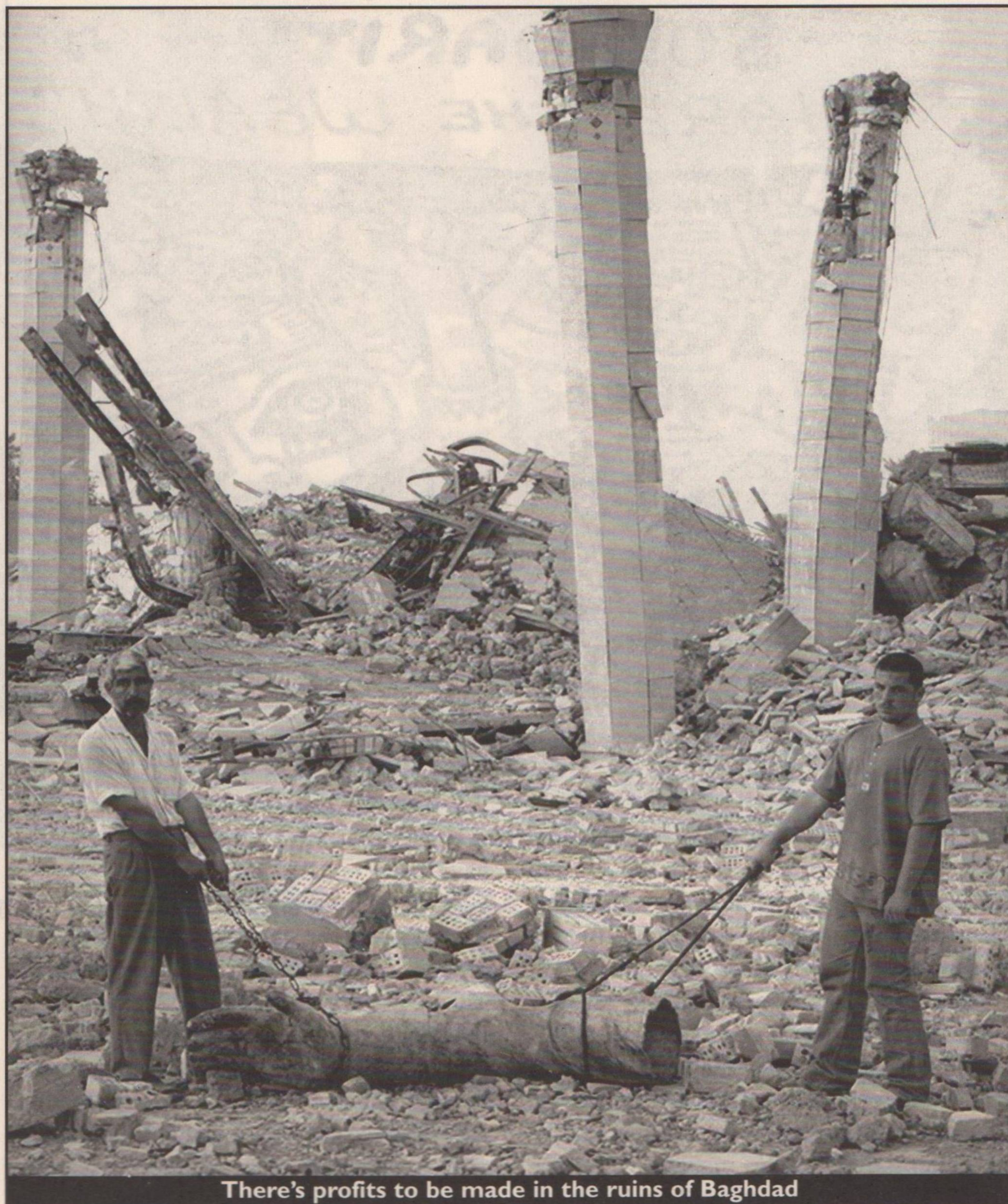
There's profits to be made in the ruins of Baghdad

Another company with a vested interest in the war on Iraq and in defence spending generally is the Carlyle Group. This is a private global investment firm managing capital worth $12.5bn. Its interests are spread across 164 companies and include