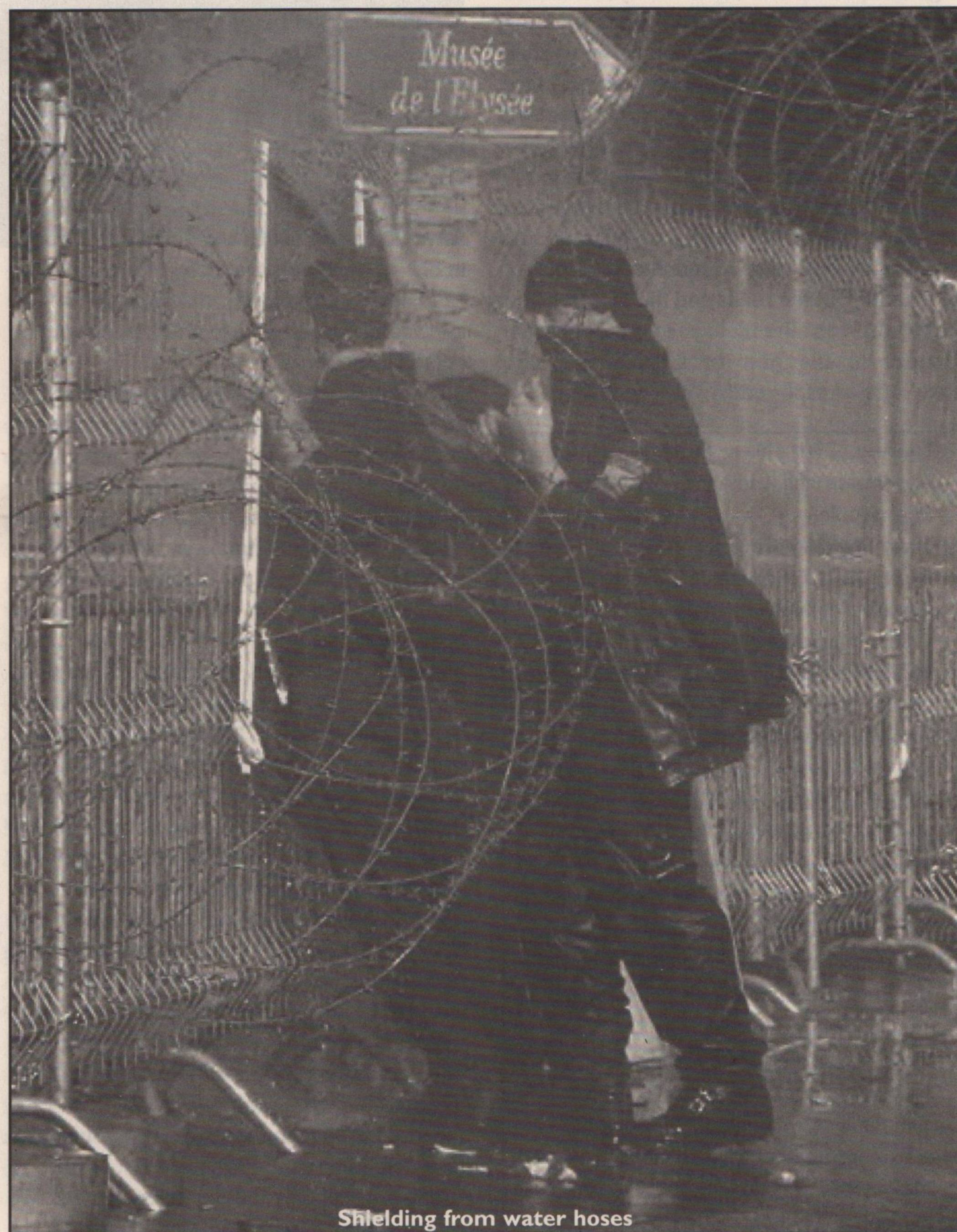
Shielding from water hoses

apart, Fairford-stylee, and a flare is fired at a lone cop photographer at one of the windows – he soon moves. Accompanied by a sound system playing bad French rock music we move on to the IOM, where windows are smashed and small fires are lit. There's a bit of confrontation with the police outside the Russian embassy compound and we get tear-gassed for the first time. Passing the Shell building a bit more trashing is done.