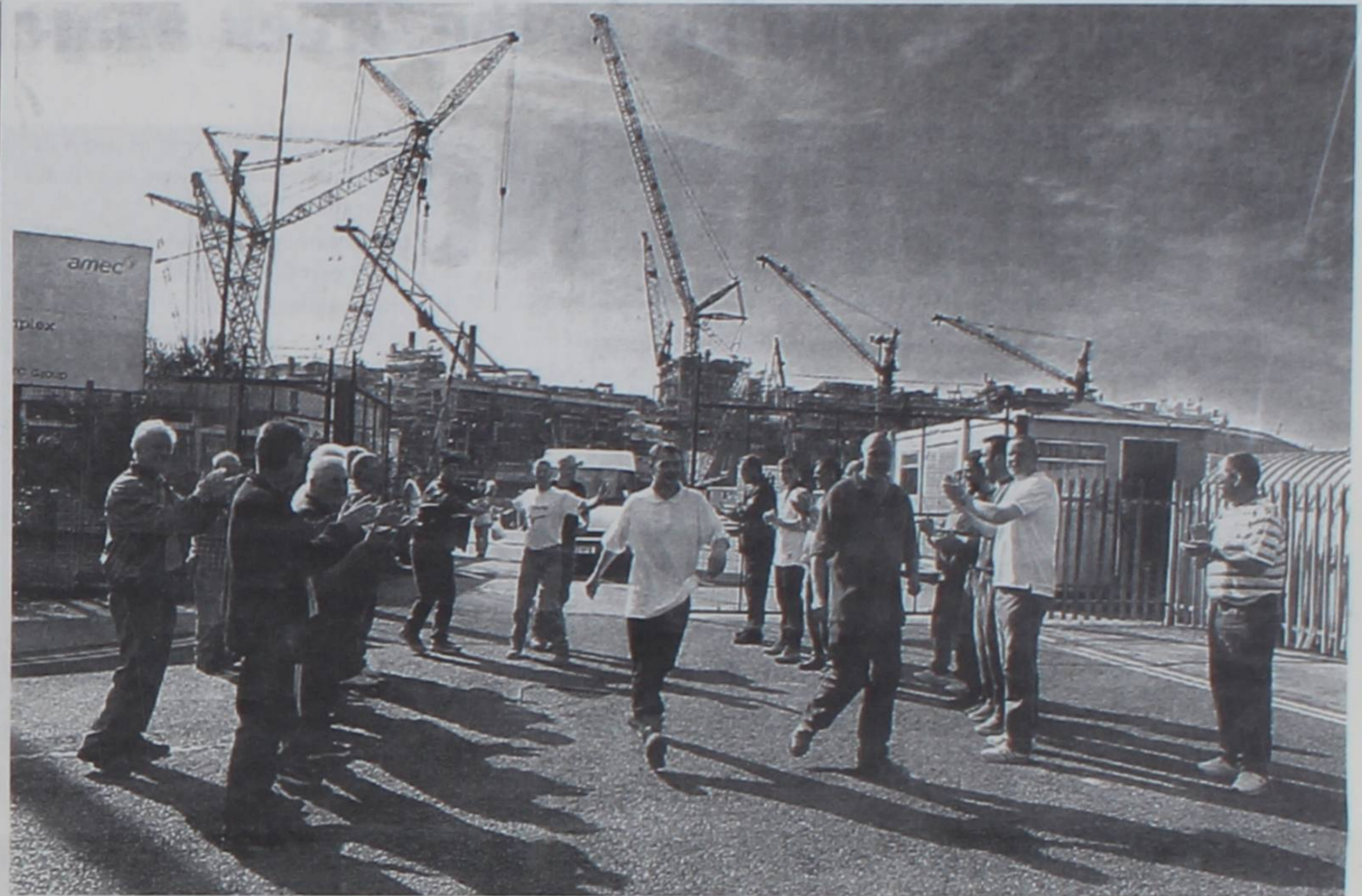
Downing tools: pickets cheering workers walking out of the AMEC shipyard on Tyneside

Strike-Ballot of financial workers at Direct Line are to be balloted on