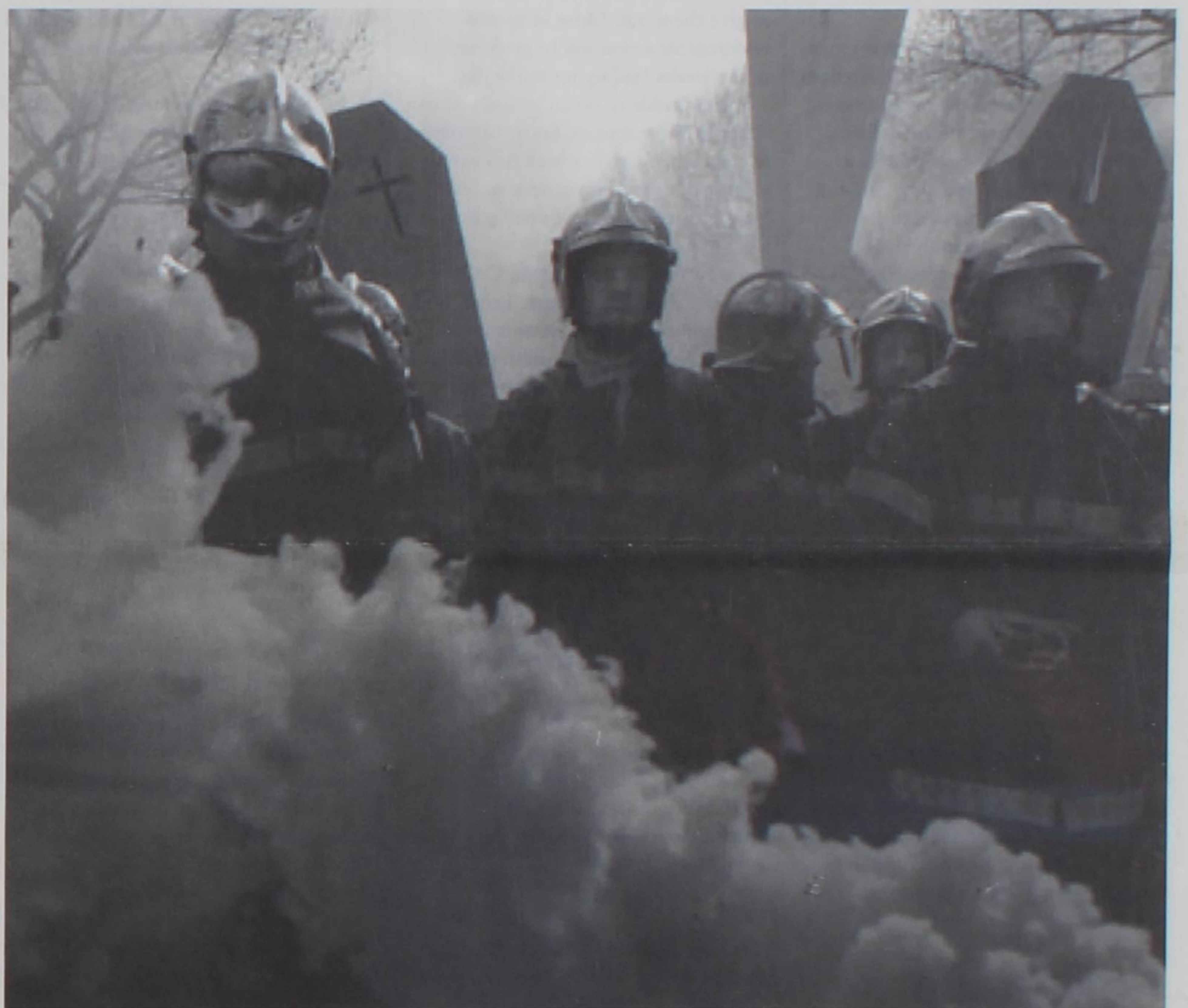
French firefighters join the struggle to defend workers' pensions as they protest in Paris. The demonstration was viciously attacked by police with teargas and water cannon, injuring several firefighters, who began to fight back with rocks and bottles. More information and incredible photographs on paris.indymedia.org