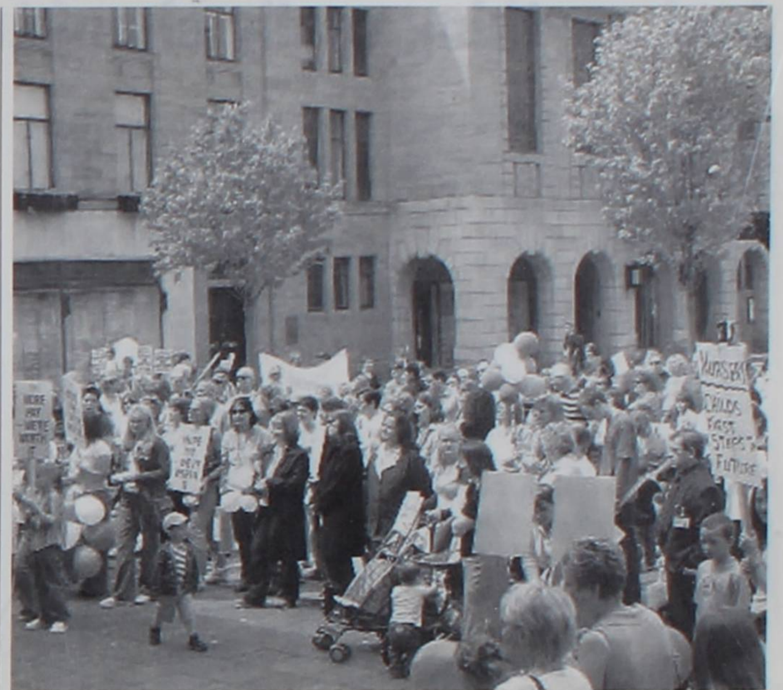
Nursery nurses and supporters demonstrate in Dundee

The bitter dispute between Scotland's nursery nurses and COSLA, the Confederation of Scottish Local Authorities, continues as many workers remain on strike. COSLA have refused to negotiate with the staff, organised by Unison, and instead deals are being made on a council-by-council basis. As Freedom goes to press it seems as if the