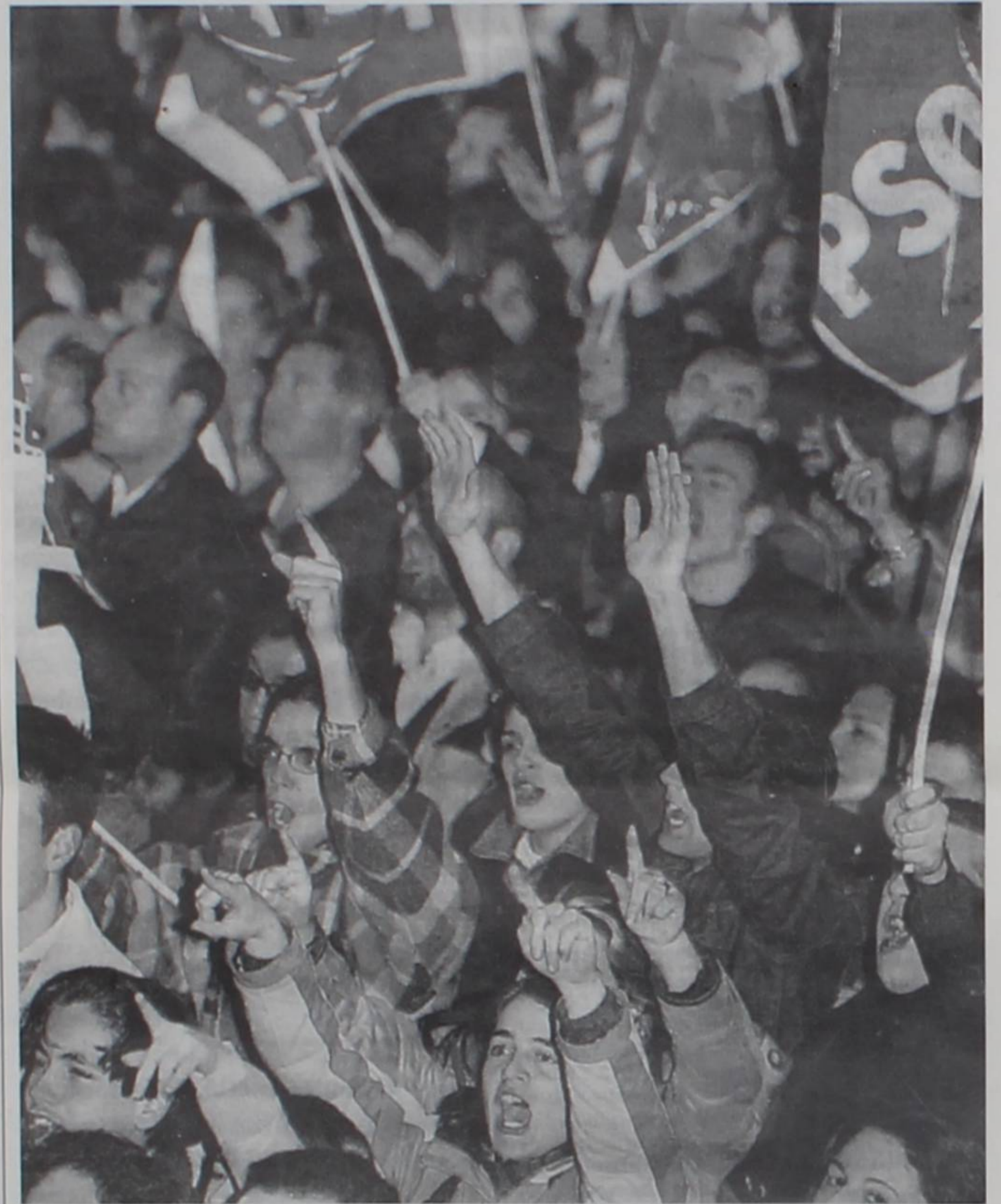
New government, same shit – PSOE supporters celebrate victory

It has also been said that if troops were pulled out it would send a very dangerous message to terrorists all over, showing them that they can change the policies of a Western government through violence. This may or may not be true. But what is certainly true is that the whole process has sent a message to Blair, and many other politicians in these same Western countries, that they can not get away forever with doing what they want, ignoring the people's will. In Spain a survey showed a year ago that 90% of the population opposed the war, and now 80% want to see the troops back. Demonstrations against the war took two million people out in the streets, people who remained when they were ruthlessly attacked by riot police who left hundreds injured. Regardless of this, the Spanish government provided as much support to Bush and Blair as they could, and was seen as instrumental in the path to war. Now this government has fallen due to its policies on this issue, which can only be seen as a very 'democratic' outcome of the crisis, and Blair is probably getting very worried. In the meantime the media are reflecting on a change brought about by terror, while no one is saying anything about the people getting fed up with being snubbed by the governments they endure. That probably suits the BBC more than acknowledging that there is a basic flaw in the representative system that makes democracy a farce.