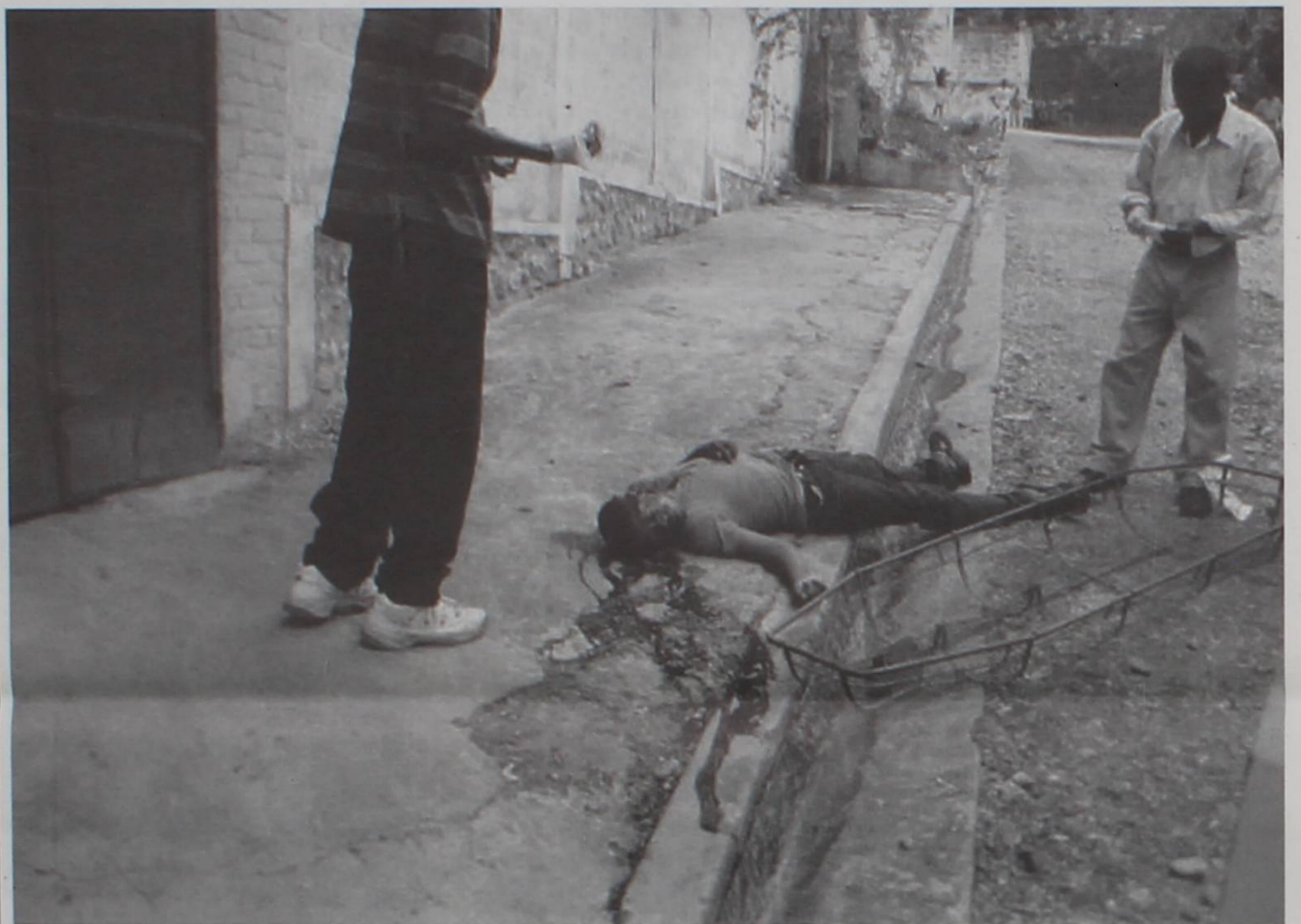
Convicted human rights abusers have resumed the repression of 1991-94

Meanwhile non-military personnel are working hard to perfect the public image of the interim government. USAID is pouring money into both the Comite des Avocats pour le Respect de Libertes Individuelles (CARLI) and the National Coalition on Haitian Rights (NCHR), both of which are acting on behalf of the rebel government. CARLI is responsible for publishing a monthly list derived from calls made on its human rights abuse victims hotline. These lists