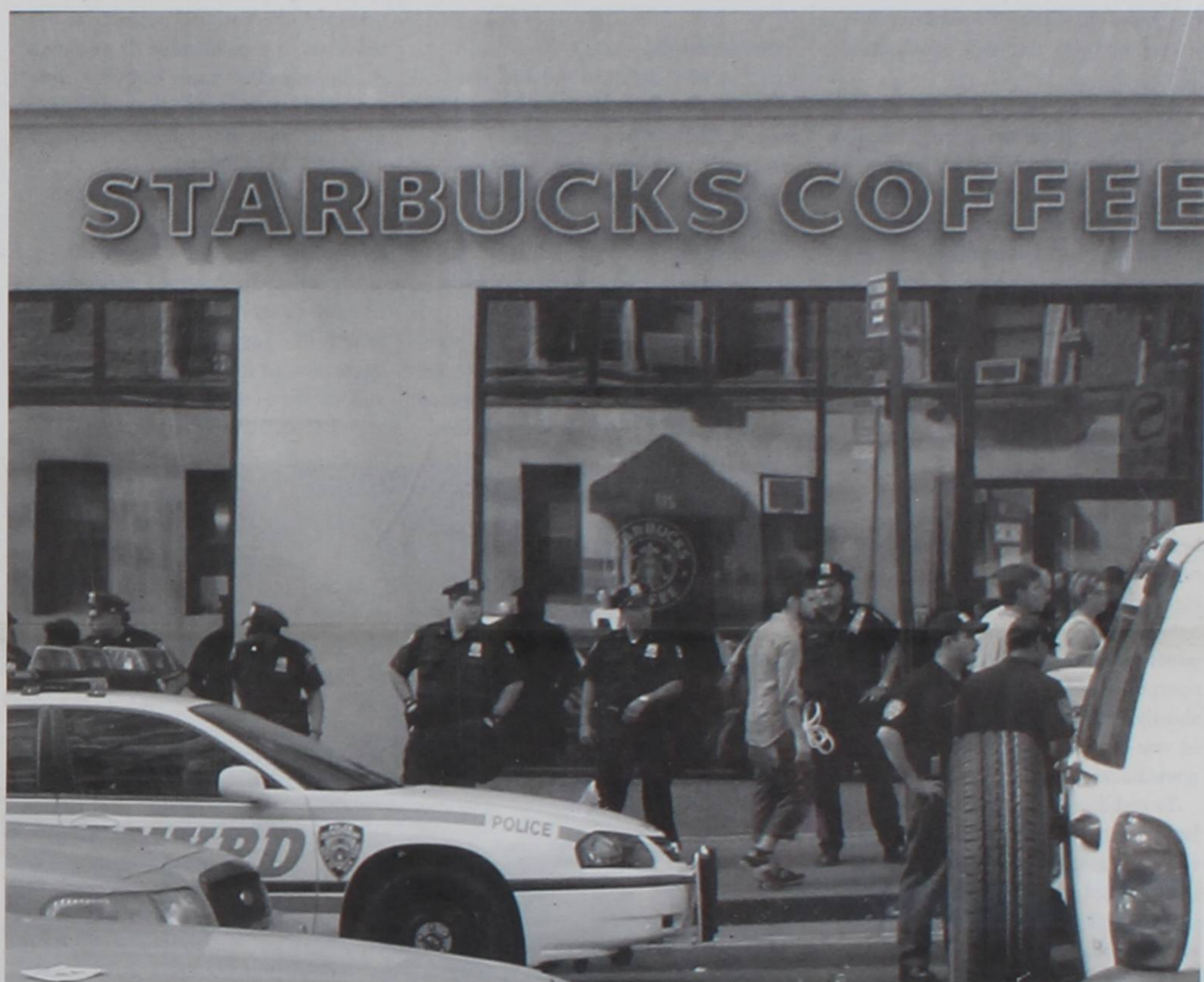
New York police protect Starbucks from a rally supporting the new Starbucks union, as part of the week of events opposing the Republican National Convention. Two people were arrested after the demonstration, who just happen to be Starbucks barristos and key active organisers in the Industrial Workers of the World.

Many workers are showing that they are in no mood to sit back and let the bosses walk all over them. Sadly that mood won't be reflected in Brighton.