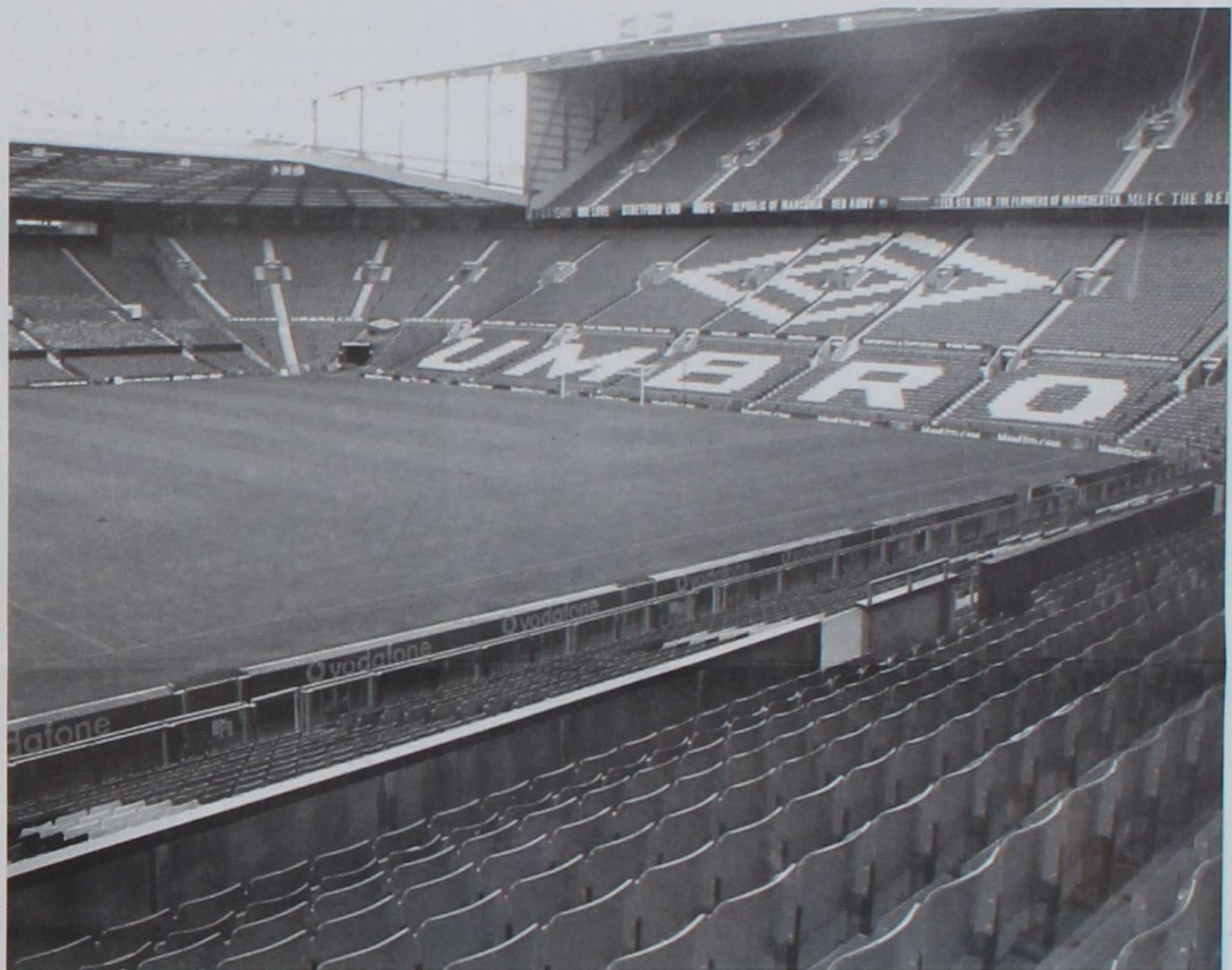
Dwindling crowds – disillusioned fans are voting with their feet

Many supporters while loving their club often to the point of stupidity are increasingly feeling that their support does not really matter; that they are not valued by their club, worse that they are being exploited through high ticket prices, rip-off food and drink and merchandise. There is only so much even the most loyal fan will take. A few years ago fans felt that they had to wear the latest club shirt. This is no longer the case. Rather than paying £50 a season for a new shirt, fans are happy