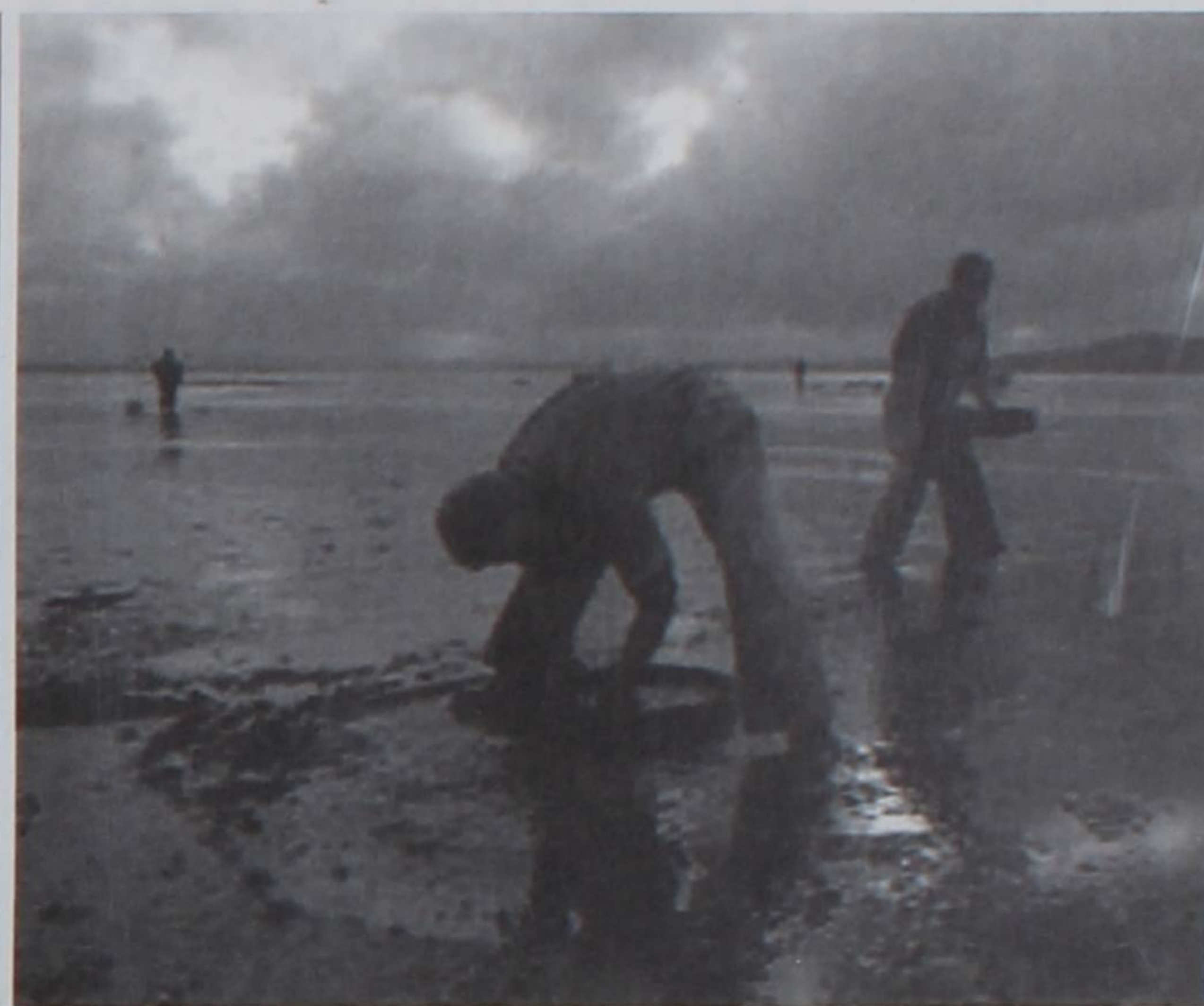
Gangs of cockle-pickers are amongst those forced into work

In the agricultural sector pressure from the multinational supermarkets on