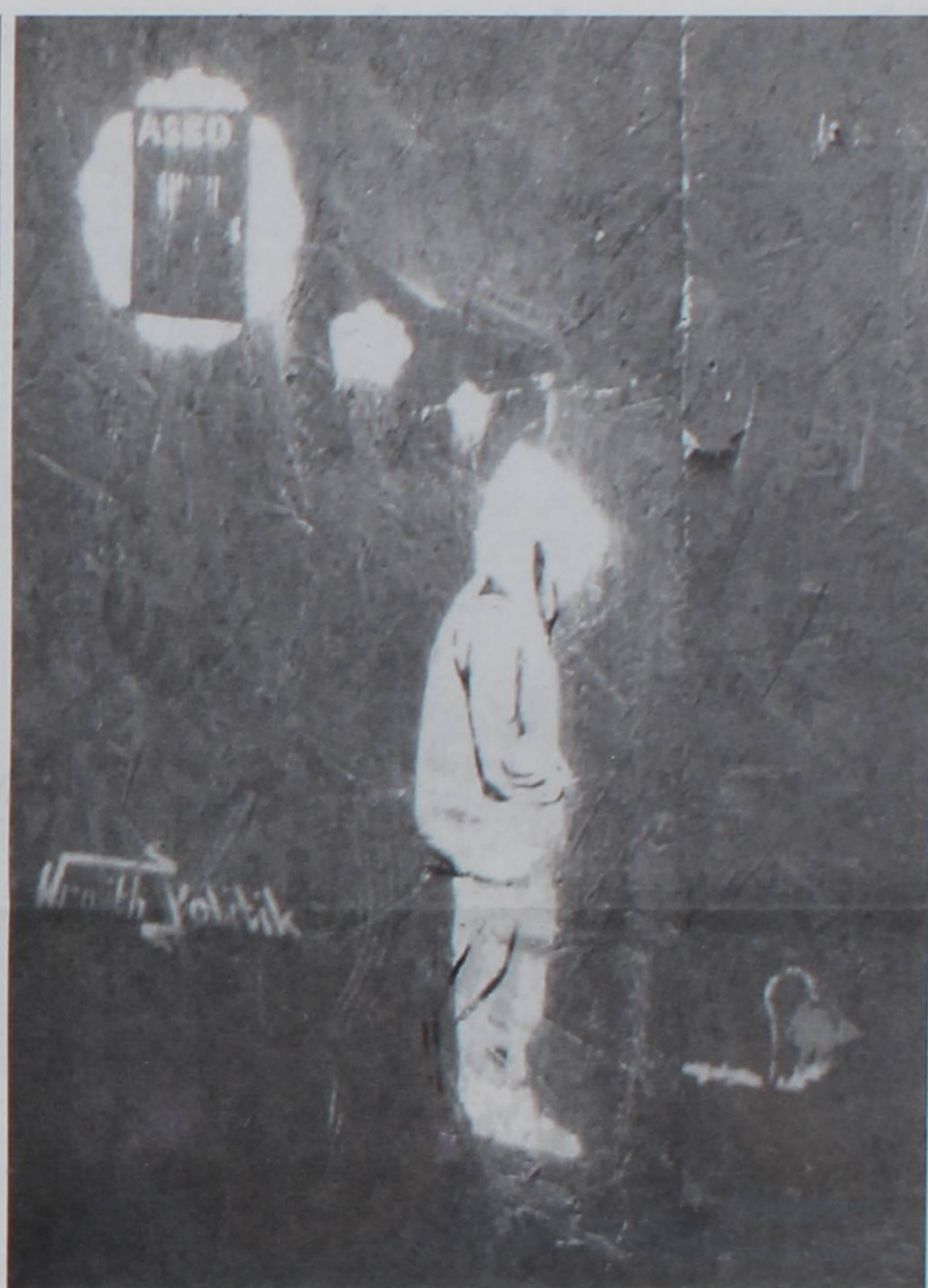
South east London Graffiti

Increased exploitation requires a compliant working class. During the Thatcher years, organised labour was cowed by a combination of confrontational policing and anti-union legislation - a strategy of broken heads and sequestration. New Labour's agenda has been to ensure that the spectre of working class militancy doesn't rear its head again. Thus the 'respect' Blair talks about isn't respect for each other, but respect for the state and respect for capital. New Labour's Britain is a prison-house for the working class, both inside and outside jail, with the sole agenda one of 'good order and discipline' enforced through CCTV, ASBOs, more cops on the streets, etc. Anti-social crime - a product of despair, depoliticisation and the fragmentation and decline in solidarity of working class communities - is (all rhetoric aside) to be displaced to those communities, and cleared out of the Bluewater shopping utopias so as not to upset the middle classes. It's like