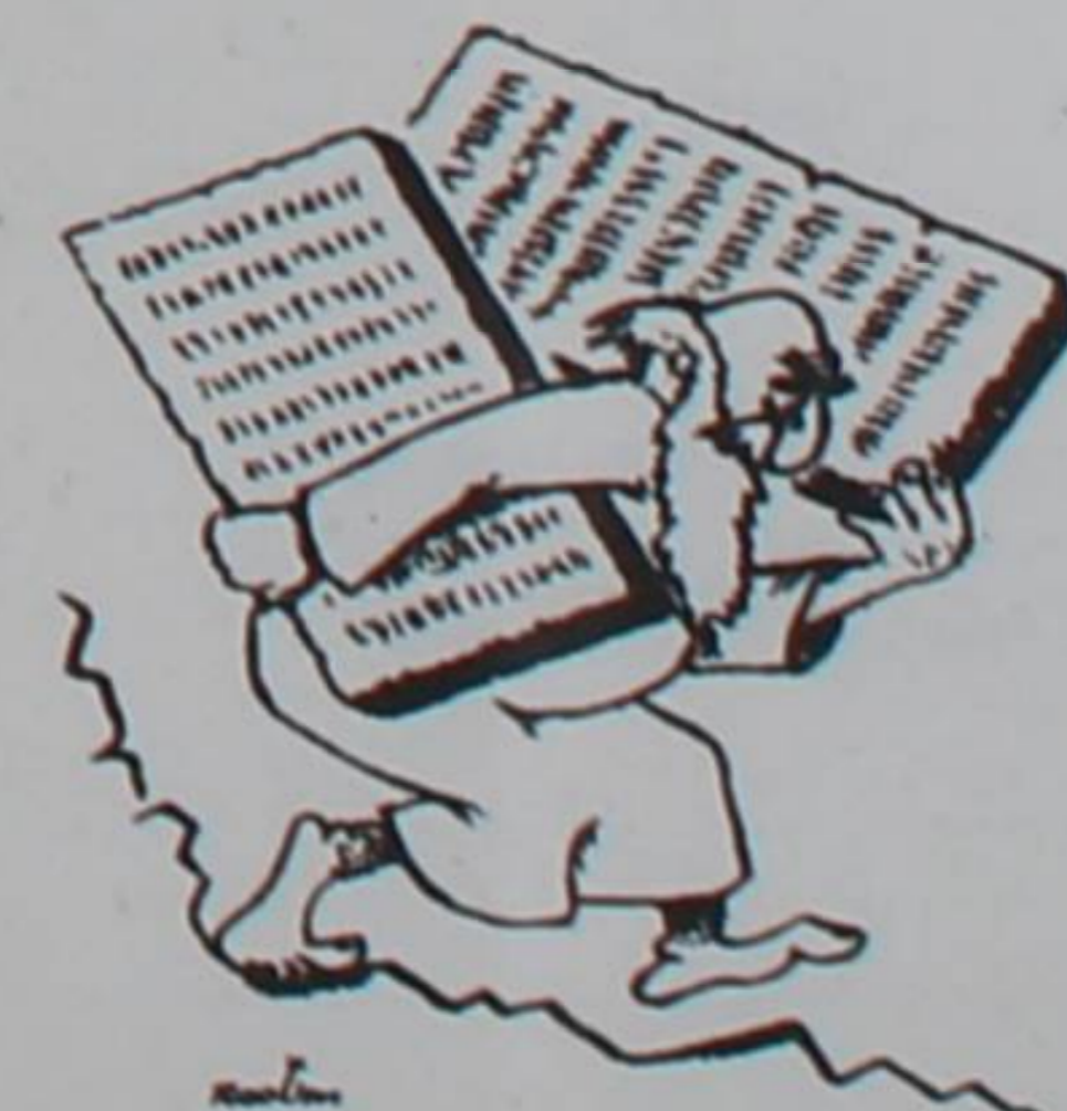
The Bible says Moses carried the Ten Commandments down the mountain

Anarchists will recognise these campaigns as compatible with anarchism.