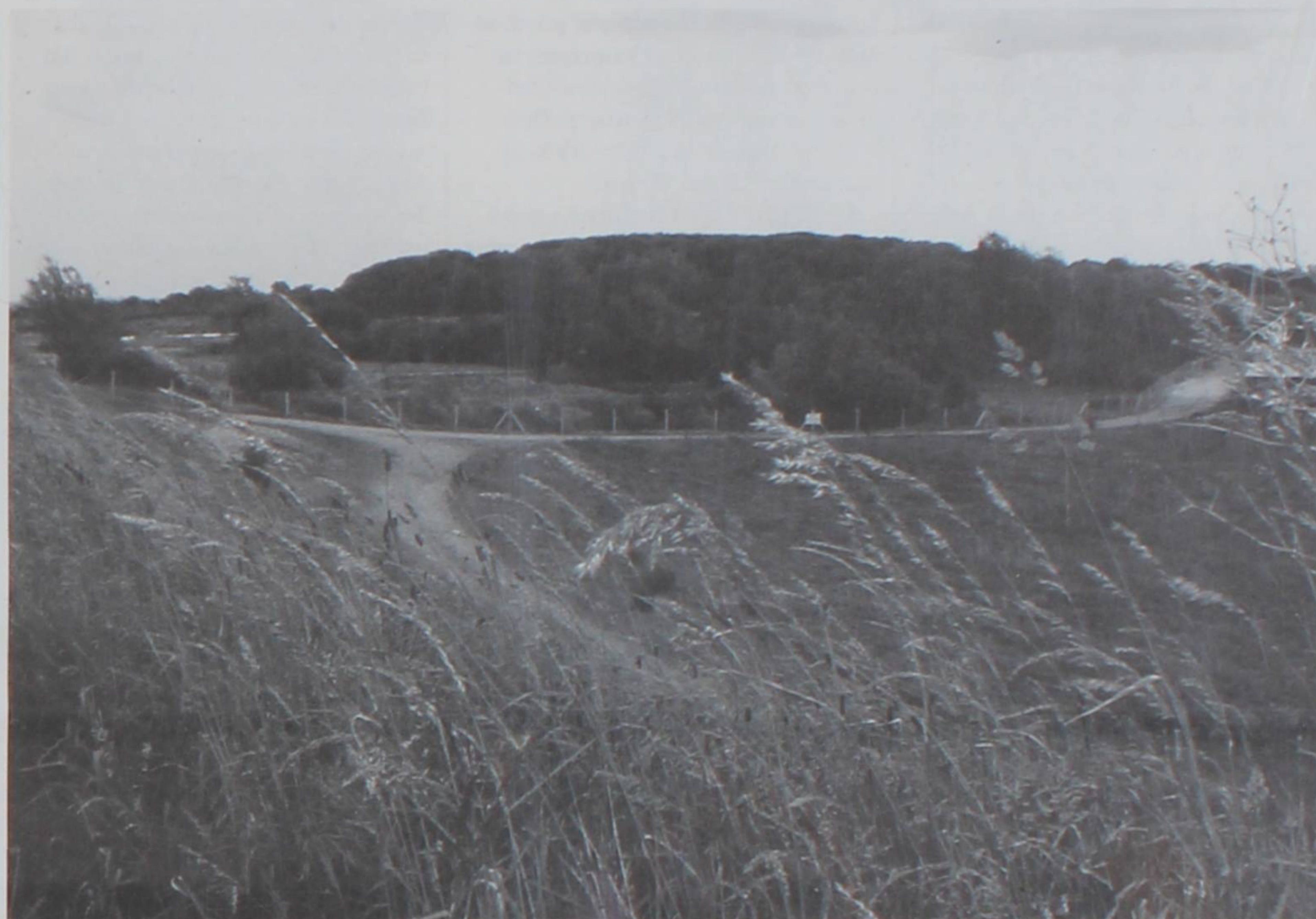
Wasteland? Onslow have stressed that the land they will be building on is an ex-quarry – these pictures show, it is anything but. In fact, up to 95% of the 2km-long development will be on what is currently greenfield land.

"Taking account of our requirement for a station to be provided and Onslow's