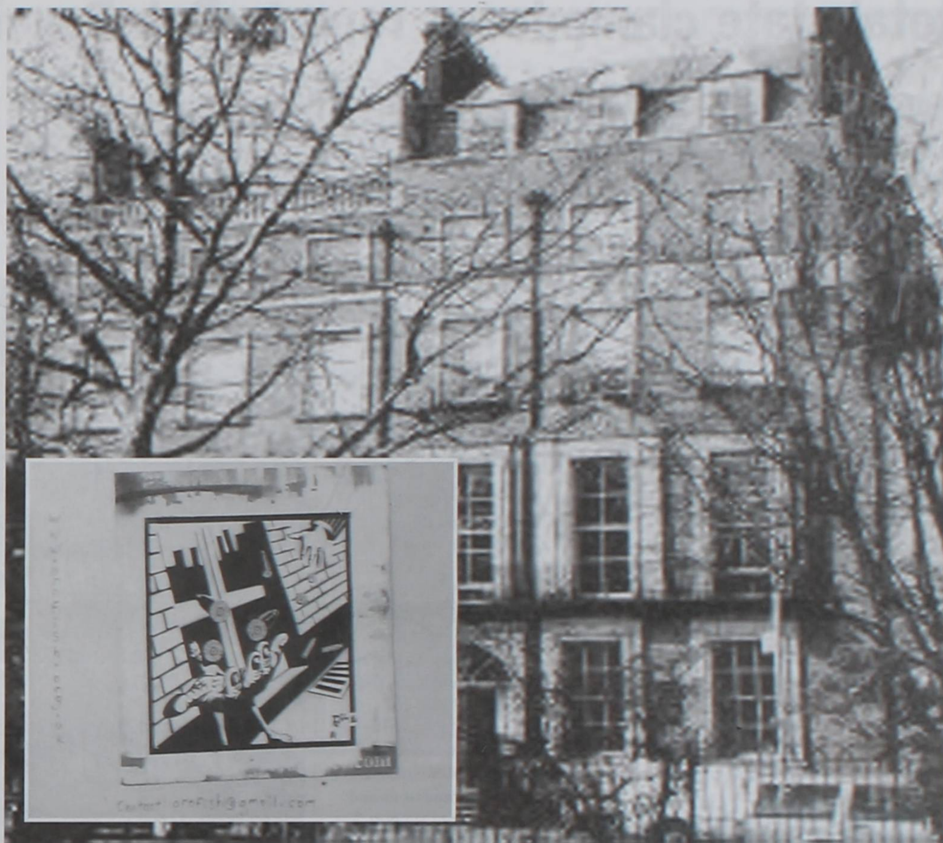
The old SSEES building at 21-22 Russell Square; inset, art by Arofish displayed at the launch event.

Members of each social centre present then gave brief presentations about the background to and history of their particular space. This was followed by a wide-ranging discussion about what everyone was trying to achieve, some of