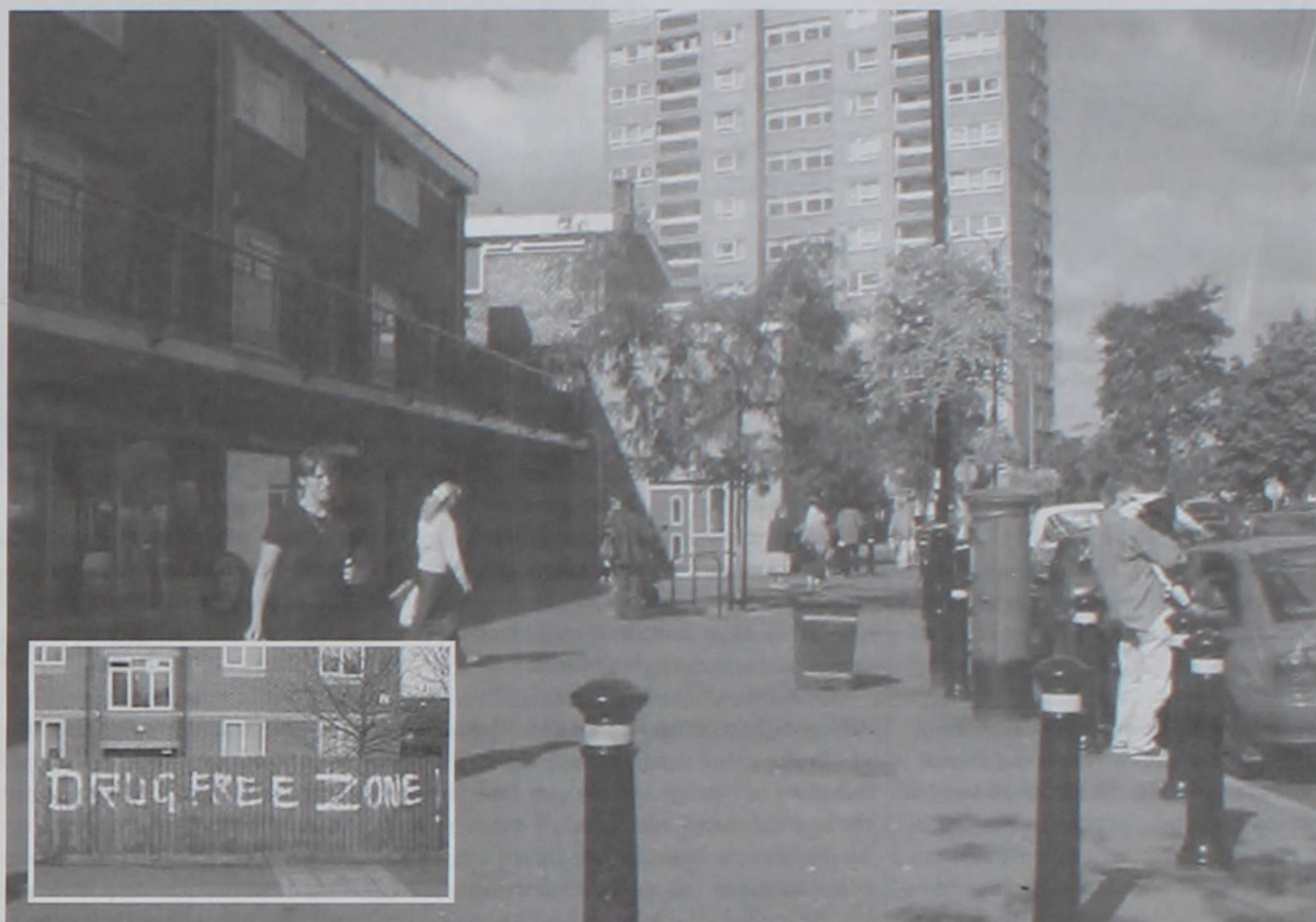
Blackbird Leys, where the IWCA has enjoyed its most visible successes

The New Labour strategy in relation to crime might best be identified as ‘Let the Working Class Eat Itself’. The reason the police are so little concerned about drug dealing and anti-social behaviour is because their policing of working class areas isn't intended to be in the interests of the working class. Aside from the fact that many cops are happy to profit from their own involvement in