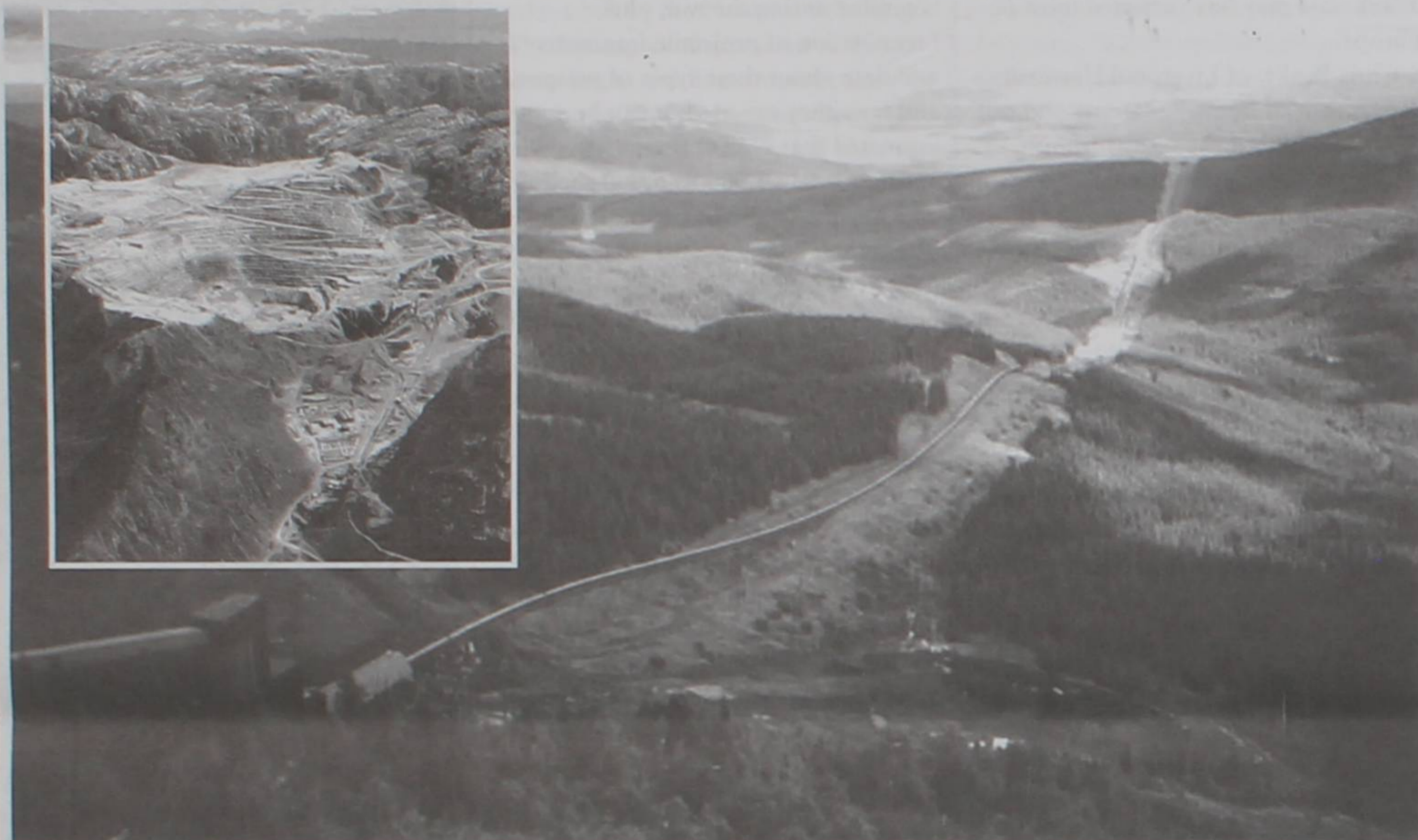
The Freeport mine, and the pipeline running through the nearby forests. The mine, at Grasberg mountain, is sited on one of the local population's most revered sites.

Lawyers in America are investigating whether the payments may have broken