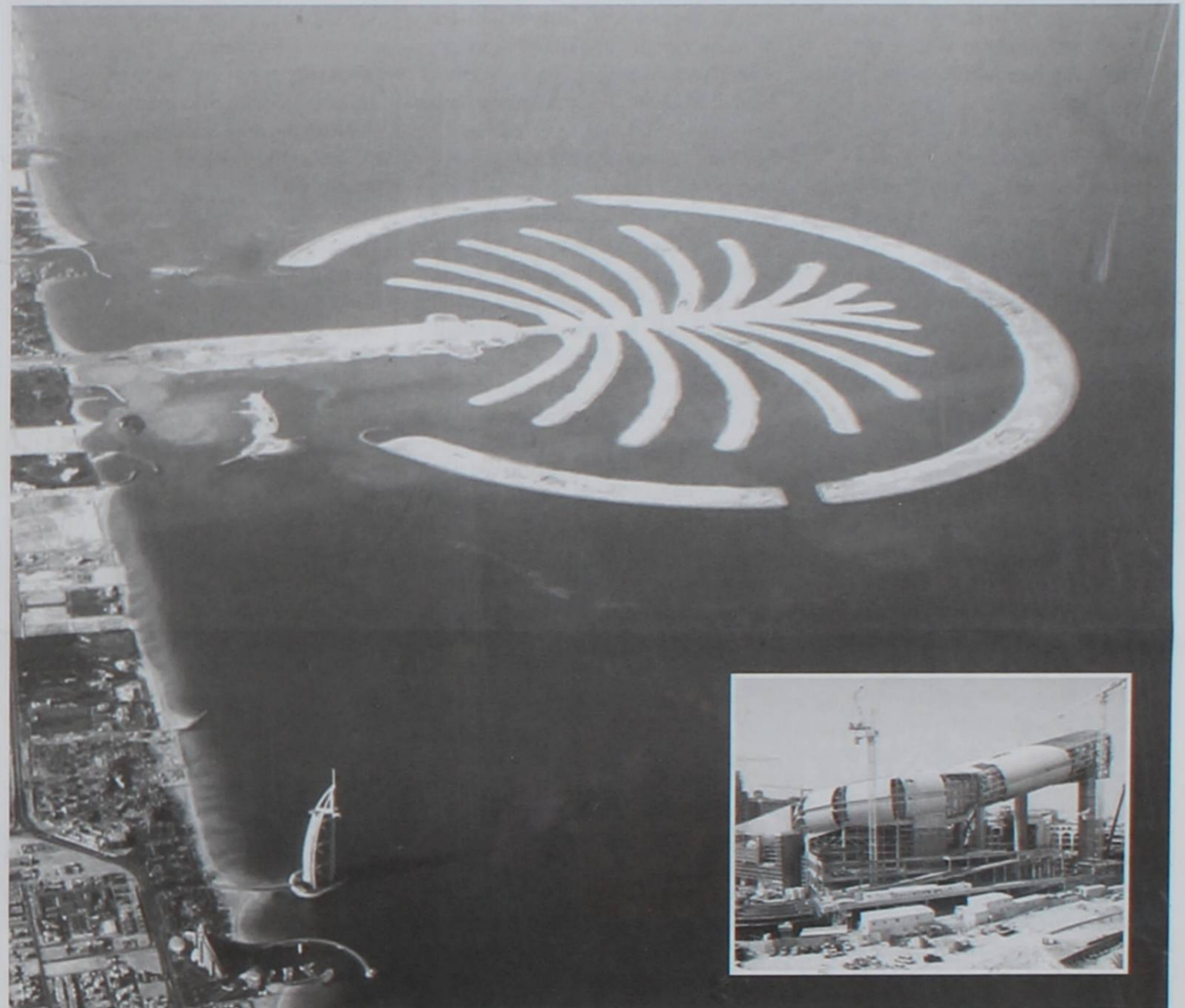
The 'Palm' at Jumeirah. Inset, the recently completed Ski Dubai facility, which has created an indoor ski slope with real snow in the middle of the desert for tourists.

without reliable water or electrical services, collapsing transport infrastructure and sanitation. For Iraqi workers, the labour laws of the Ba'athist state have been replaced by complete deregulation – with those still in work left unpaid for weeks on end. Contractors working in Iraq, including Halliburton Corp, have brought tens of thousands of migrant workers to Iraq from impoverished countries such as Nepal, the Philippines and Bangladesh to carry out menial jobs. The US military requires that contractors hire migrant workers to work at bases to avoid the possibility of insurgent infiltration.