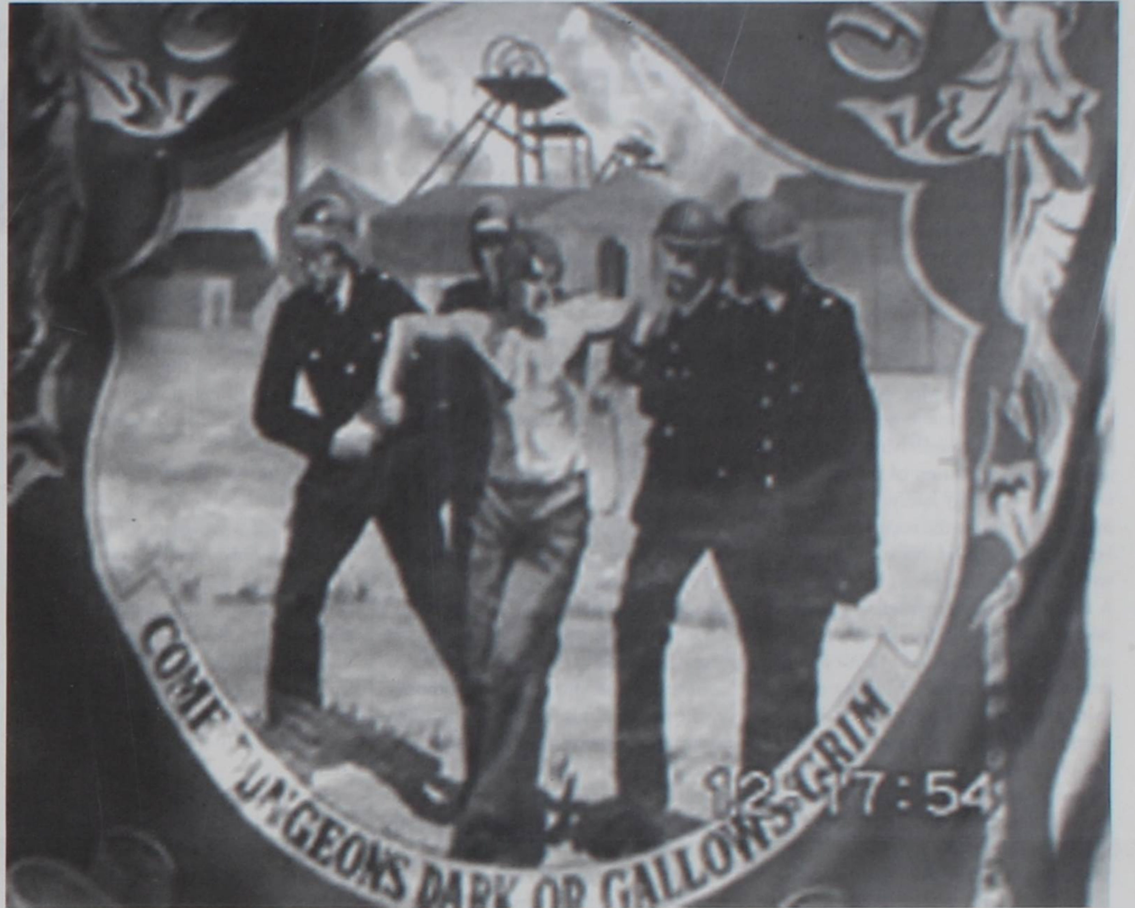
Banner photographed during the Reclaim the Streets/Liverpool Dockers demo (1997)