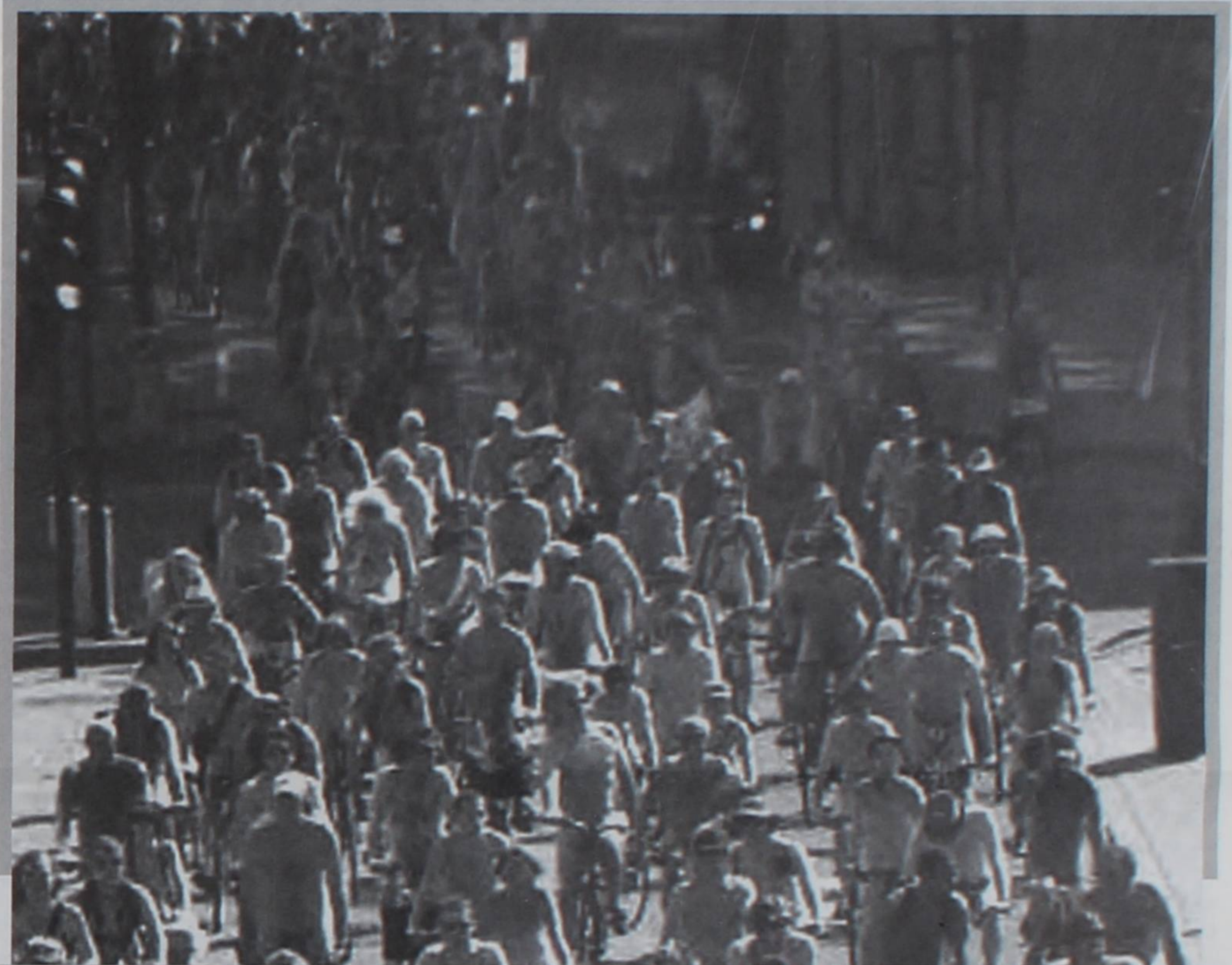
On 10th June, people in over 50 cities around the world took part in naked bike rides as a protest against oil dependency and car culture. Between 600 and 1,000 cyclists, along with a few rollerskaters, rollerbladers and others took part in the London event.

"On the positive side, UCU members are to be applauded for taking this action. It is to be hoped that the form, patchiness and isolating nature of the action along with incompetence higher up the union will not affect members' resolve next time round. For EWN and