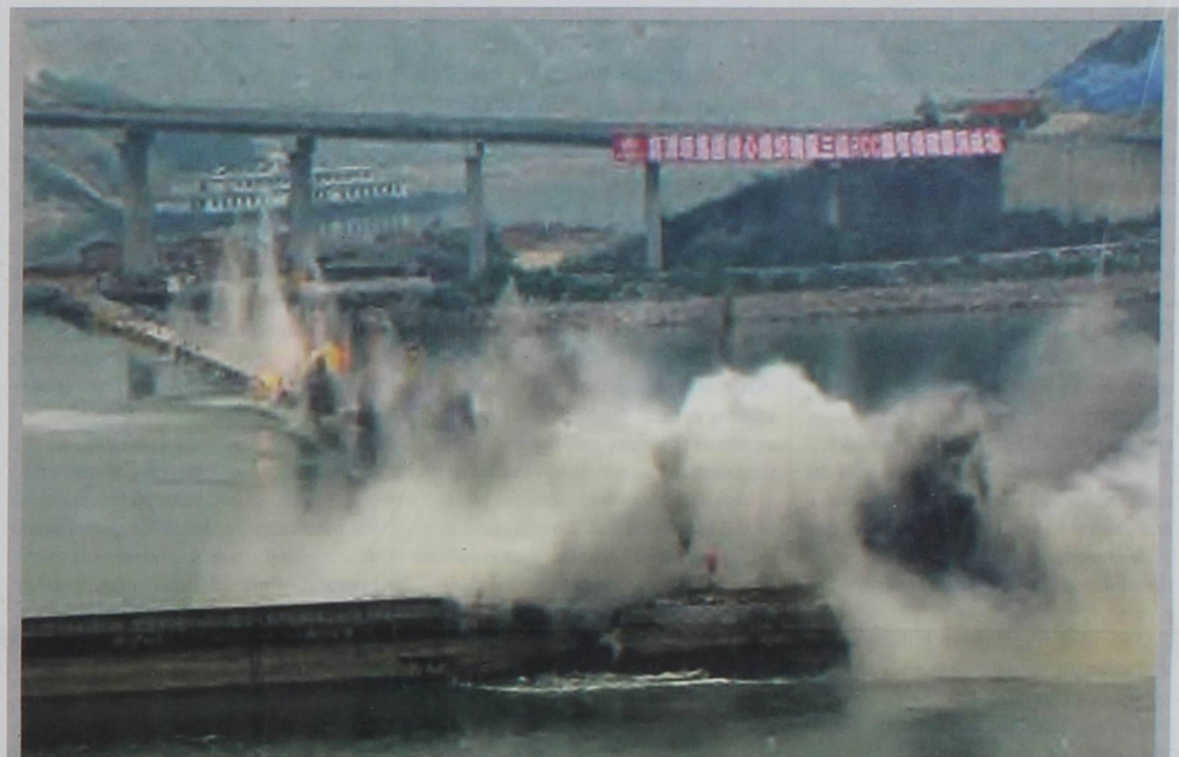
Engorged: The Three Gorges Dam becomes fully operational as the final breaks are destroyed and water rushes in. One million people were displaced to allow for a massive expansion behind the dam, which is the biggest in the world. Human rights and environmental campaigning groups have attacked the project, which is projected to provide 3% of China's power needs, saying apart from the displacement already caused, there will be a huge pollution buildup behind the dam, and destruction of rare wildlife habitats.

However, a footnote in the NAO report acknowledges that: "We would expect participants on Workstep to have substantially more barriers to employment than those on New Deal