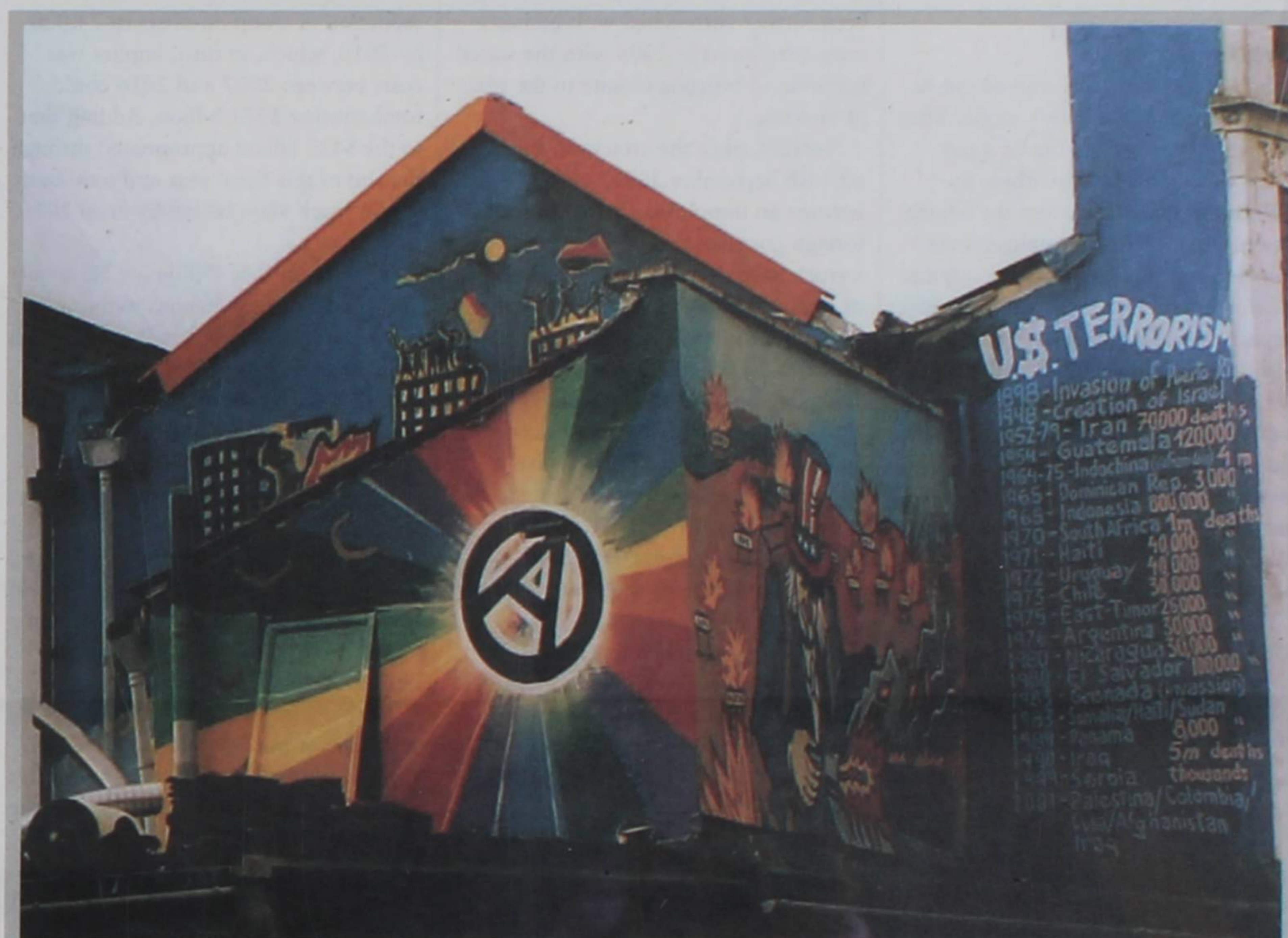
FREE AND CLEAR: Congratulations to the Kebele Social Centre as it clears its mortgage! Freedom gets the full story from a volunteer at the Bristol building, see page 3.

The new advert still provides for outsourcing of NHS commissioning,