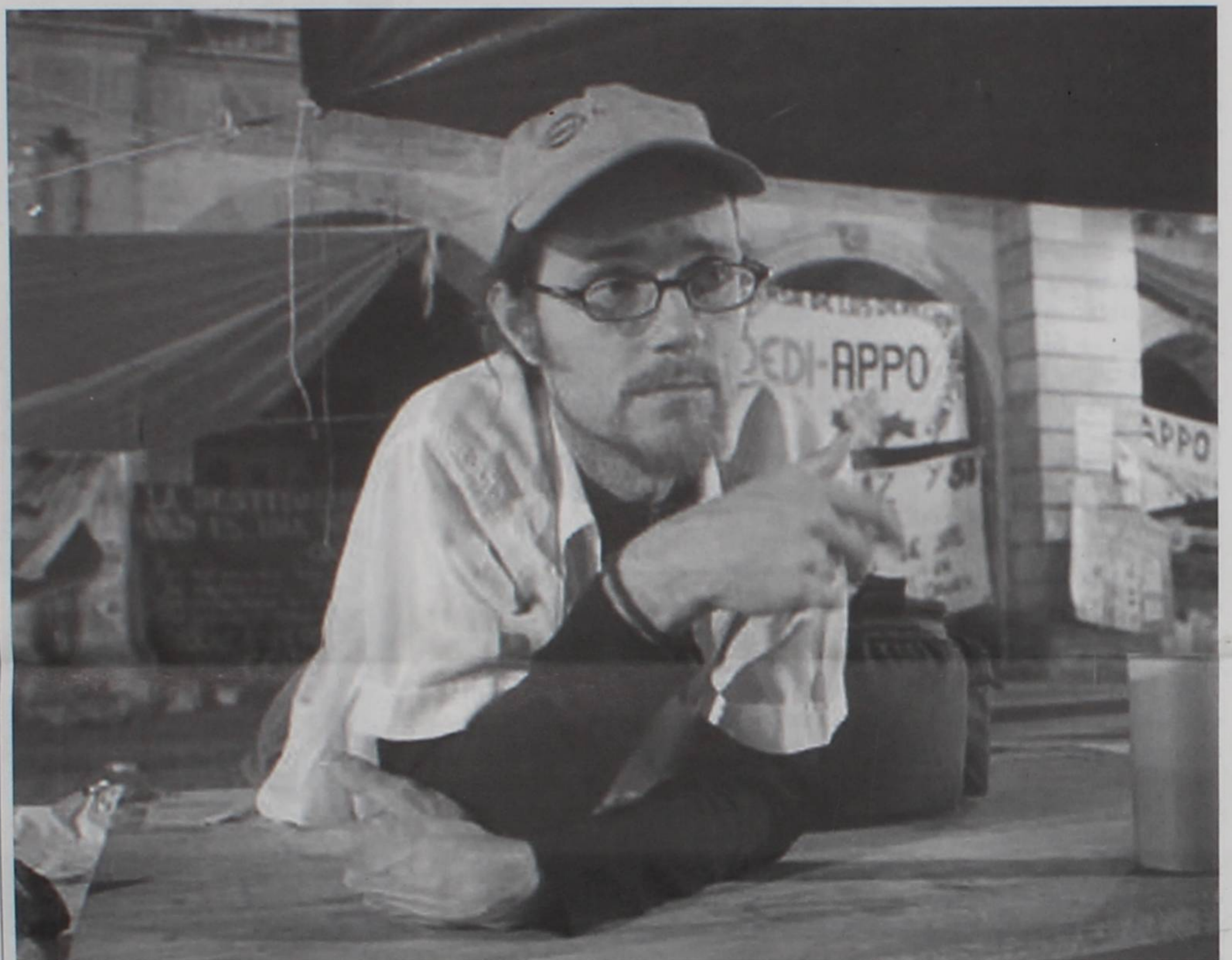
Brad Will on 25th October, just days before he was shot and killed by pro-government forces (also see page 2).

At the time of writing however, it looks as though the teachers have agreed to go back to work which, along with the