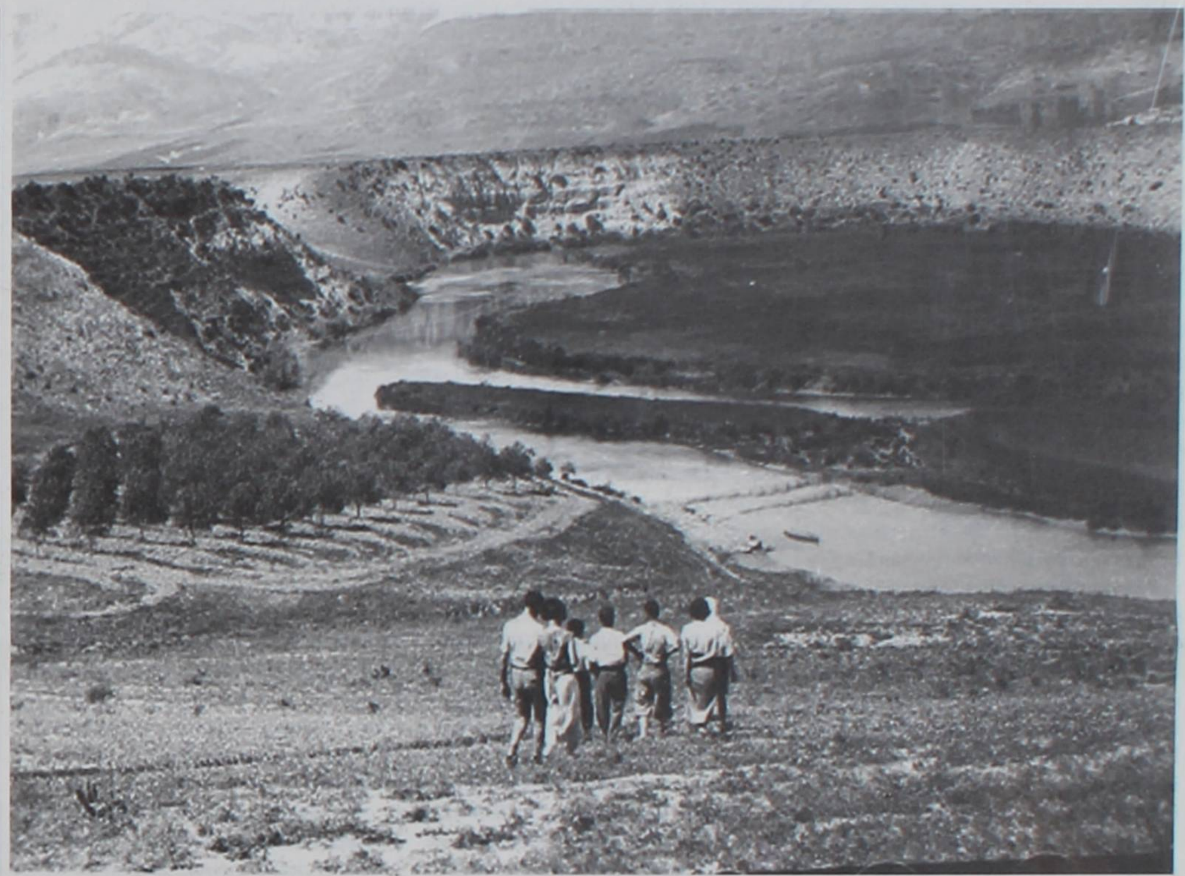
Degania was the first kvutza established in the region in 1909. This picture was taken in the 1930s.

Zionism in its statist form was never popular among the kibbutzniks, the vast majority of whom were openly hostile to the idea of a Jewish State. While the renaissance of the Jewish