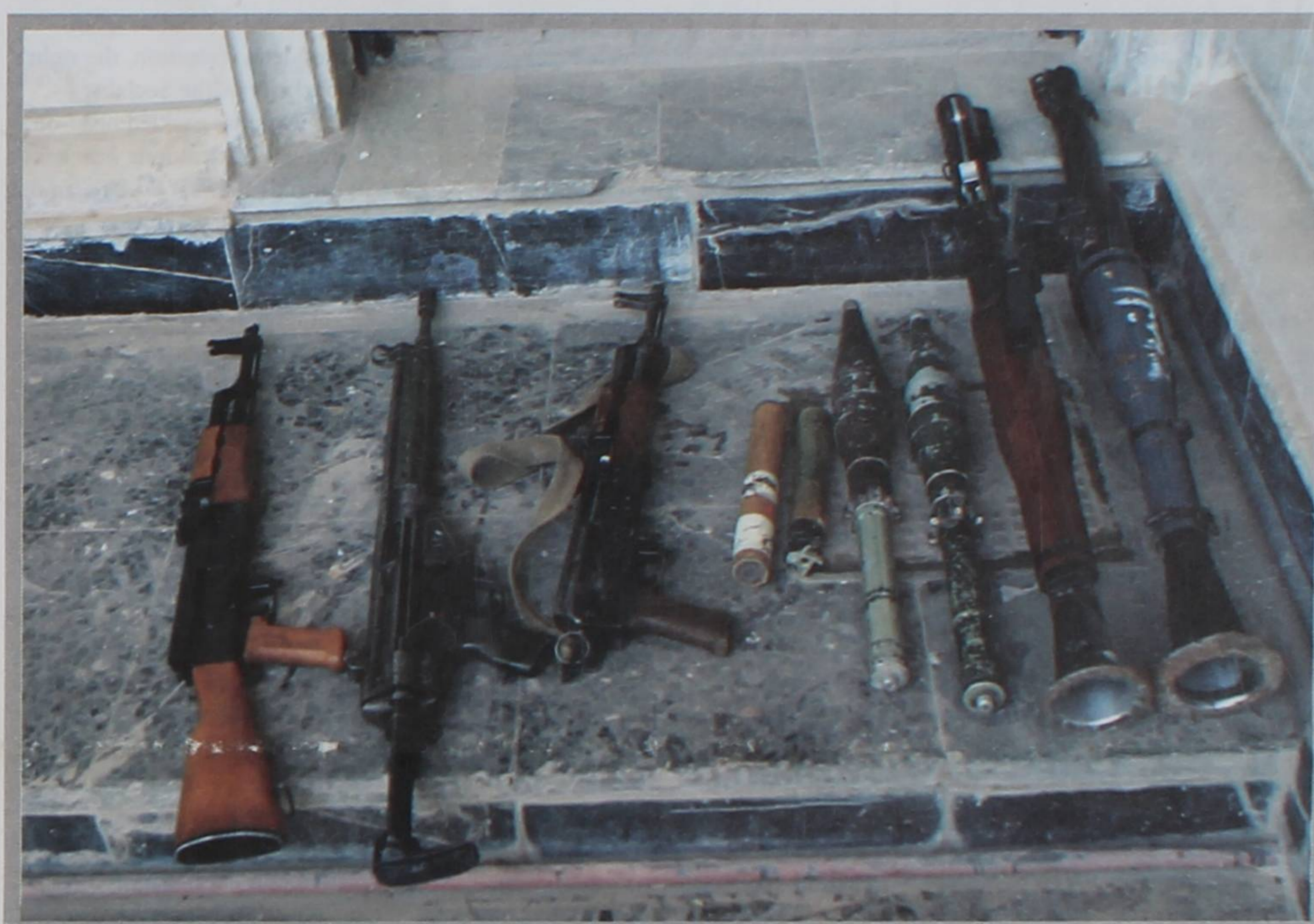
CLEVER INTELLIGENCE: Following an attack on the US Embassy in Greece this month, when a small rocket was fired, intelligence analysts released this photograph, saying it was being examined by counter-terrorist units. On further examination however, the embarrassed sleuths were forced to admit not only that it wasn't in fact connected to the incident, but that the ultimate source was actually a publicly-available Wikipedia photo - taken by a US army officer.

of the residents but in reality you have to constitute yourself in such a way that you are co-opted into the state. The danger is you start to perform a different