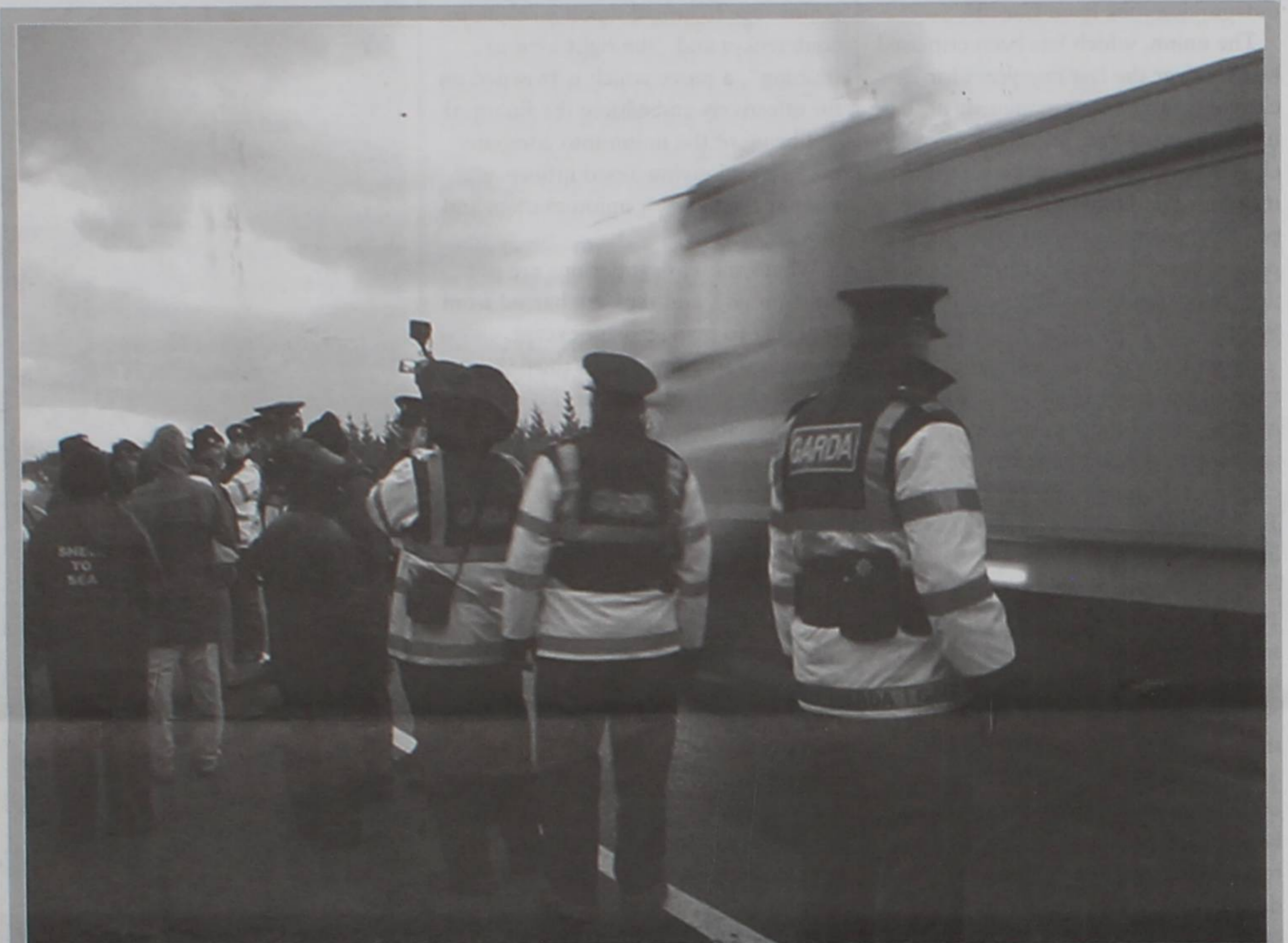
ROSSPORT GOES ON: A Shell truck rumbles past as Gardai hold the way open. 8th January saw hostilities re-open between people opposing the building of the Ballinaboy Terminal site and its notorious pipeline, which led last year to the imprisonment of five local men for refusing to let the line be built through their land.

The church was among the first western institutions to help lever Portugal into power. Beginning with a failed attempt by Father Barroso, aided by a Portugese gunboat, to set up the first modern Catholic mission there, the