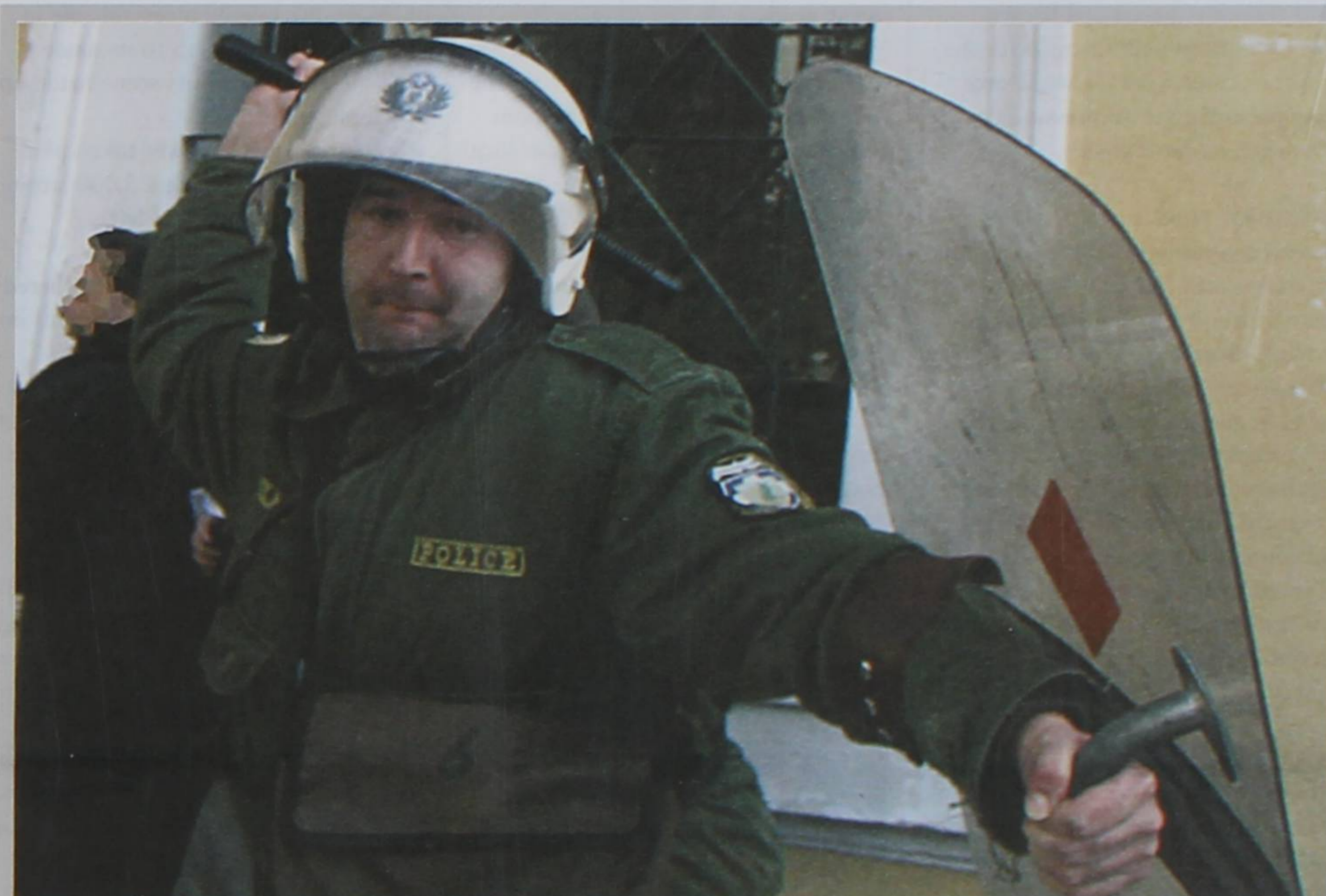
MY BIG FAT GREEK RIOT COP: A policeman takes exception to photographers during solidarity marches in Greece against plans to legislate against public ownership of the university system. Marches took place across the country in early March, and aggressive police responses led to scores of arrests. Students have been injured and allegedly detainees have been denied access to lawyers. Tear gas and police charges have been used to break up peaceful demonstrations and riots spread in Thessaloniki city and Athens. Large protests against the plans, which come amidst moves to try and curb student radicalism in Greece by the government.

Although this issue is not focusing on the major spectacles of 2007, there are a number of camps and confrontations planned or ongoing this year, including against nuclear arms and war machines at Faslane 365 and Disarm DSEI in September, against climate destruction at this year's climate camp, planned for August,