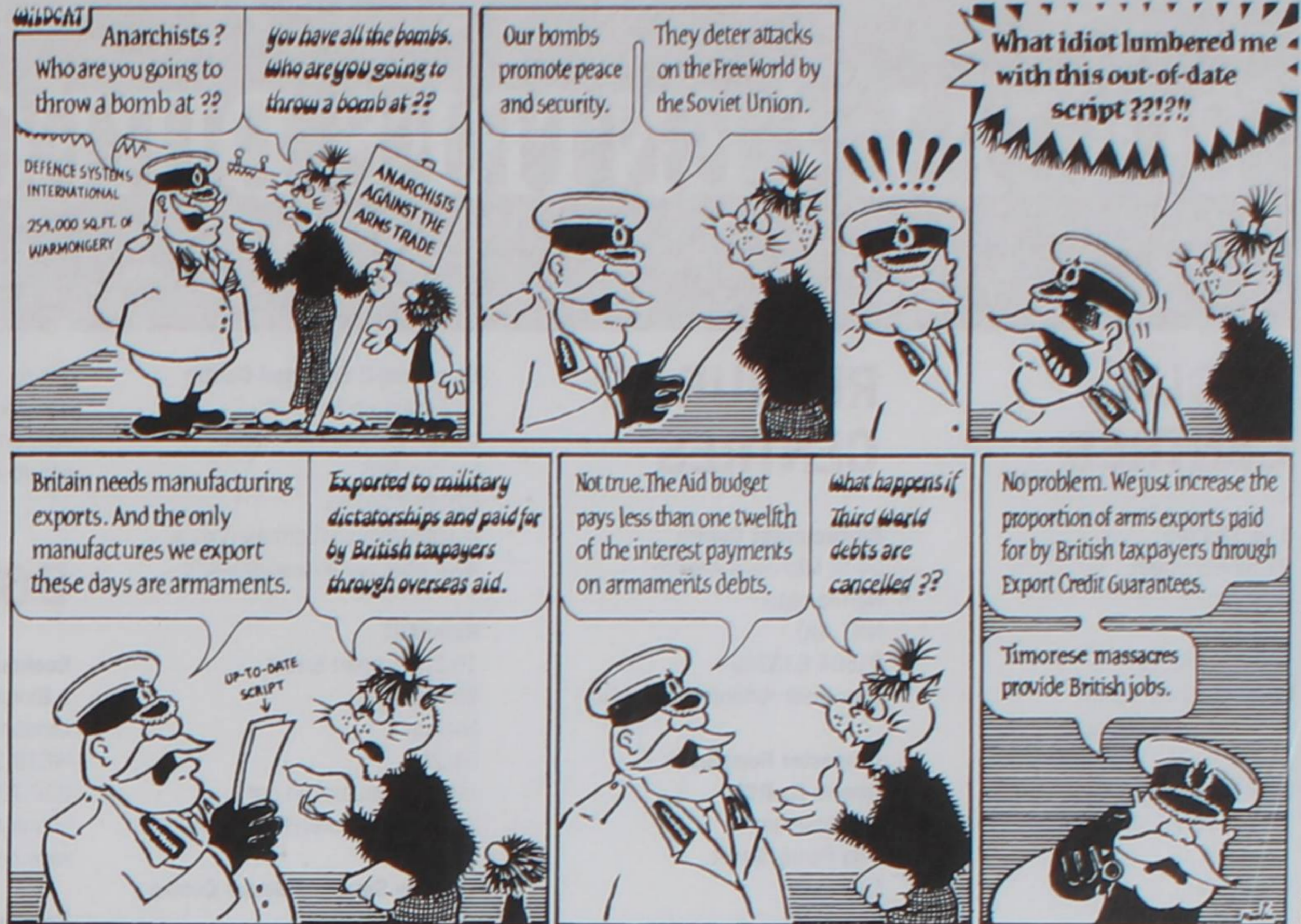
taken from Wildcat: Anarchists Against Bombs by Donald Roounn, Freedom Press, £3

He mused for a second, and continued. "1) A robot may not injure a human being, or, through inaction, allow a human being to come to harm, unless said human being has been classified as a terrorist by the Department of Justice. 2) A robot must obey orders given to it by human beings except where such orders would conflict with the first law, or could invalidate its warranty, conflict