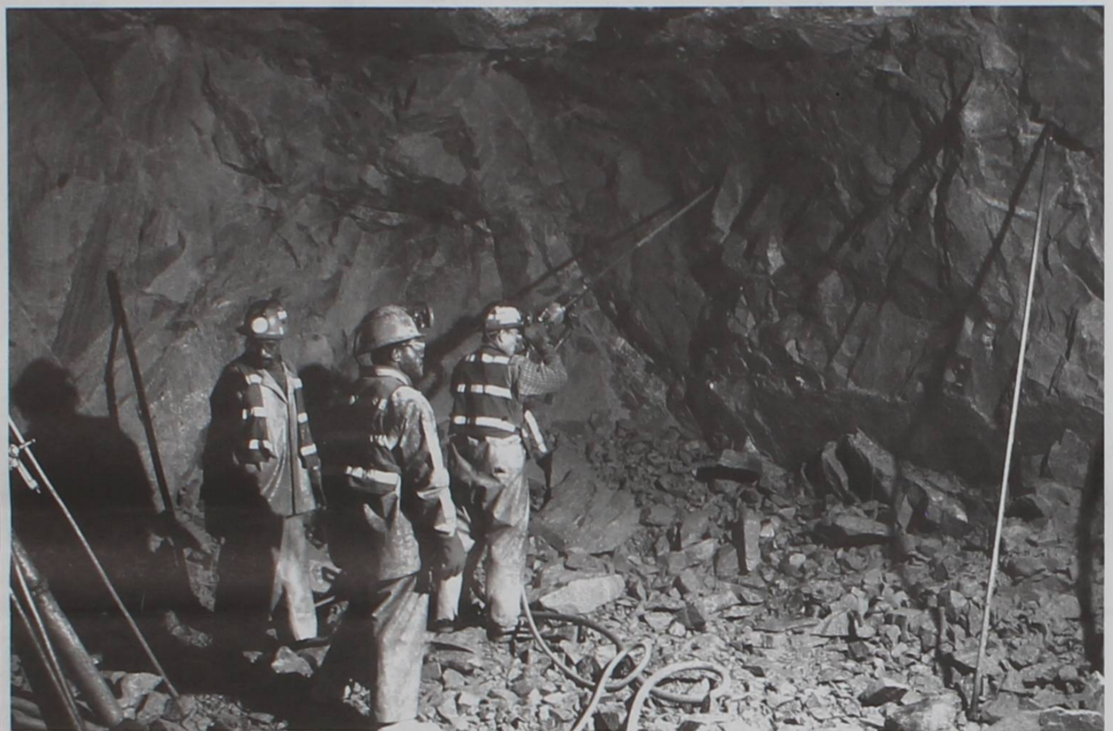
UNFAIR: Trainees at the Freeport mine where the company has been accused of unfair and discriminatory hiring practices at the world's largest gold and copper mine.

Despite the intense military and police presence, workers elected to strike when their calls for talks with Freeport executives were rejected by the company. Although no violence was reported against those taking part, an internal Freeport memorandum was leaked to the Reuters news agency on 19th April in which company executives described the strike as illegal and that workers who left their jobs to participate in the illegal strike, "could be subject to disciplinary measures," an indication of how seriously Freeport has taken events