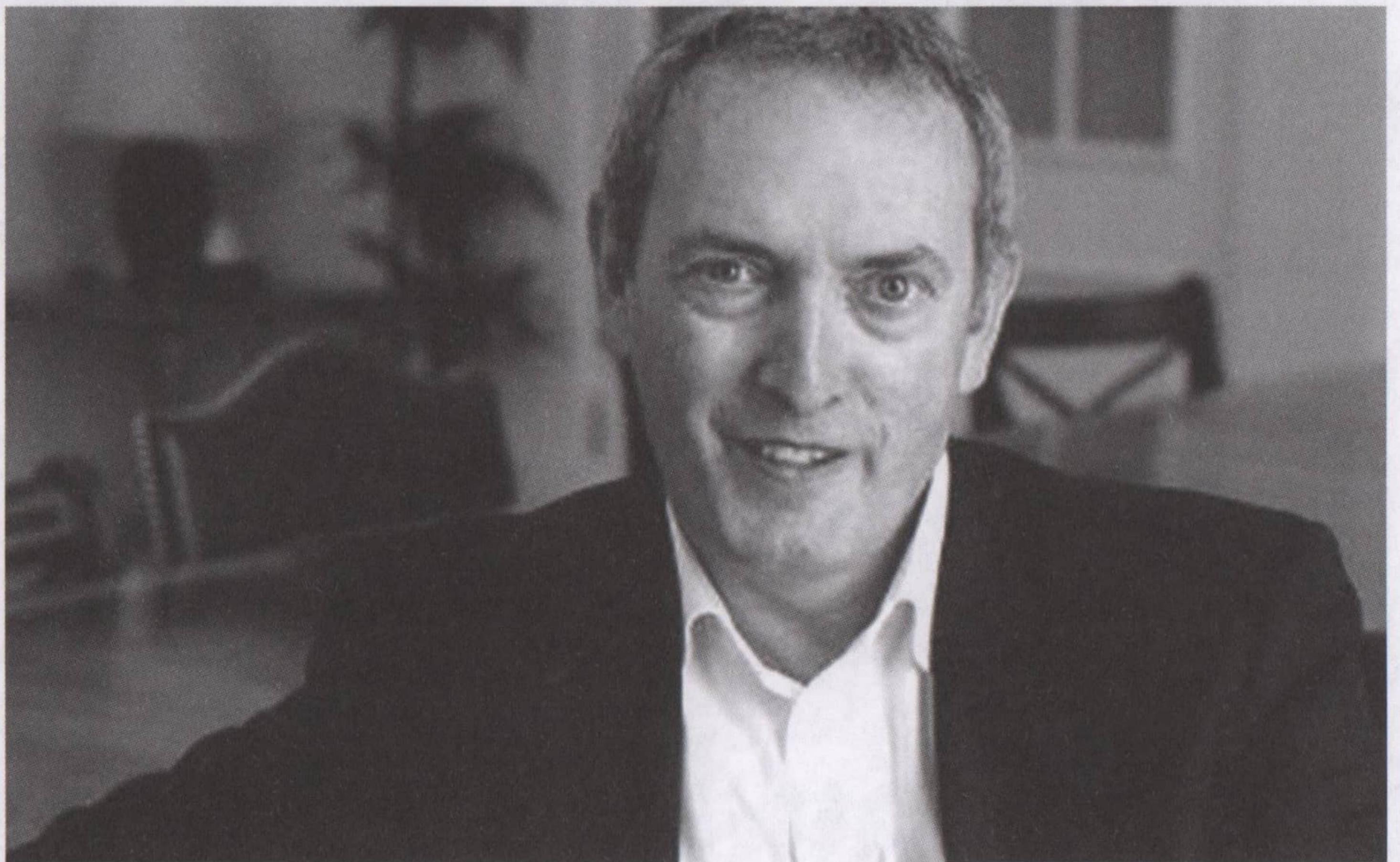
John Hutton, Secretary of State for Business

Secretary of State for Business John Hutton said: “It is clear that private and third sector organisations play a valuable part in delivering modern public services and our substantial investment over the past ten years has paid off.”