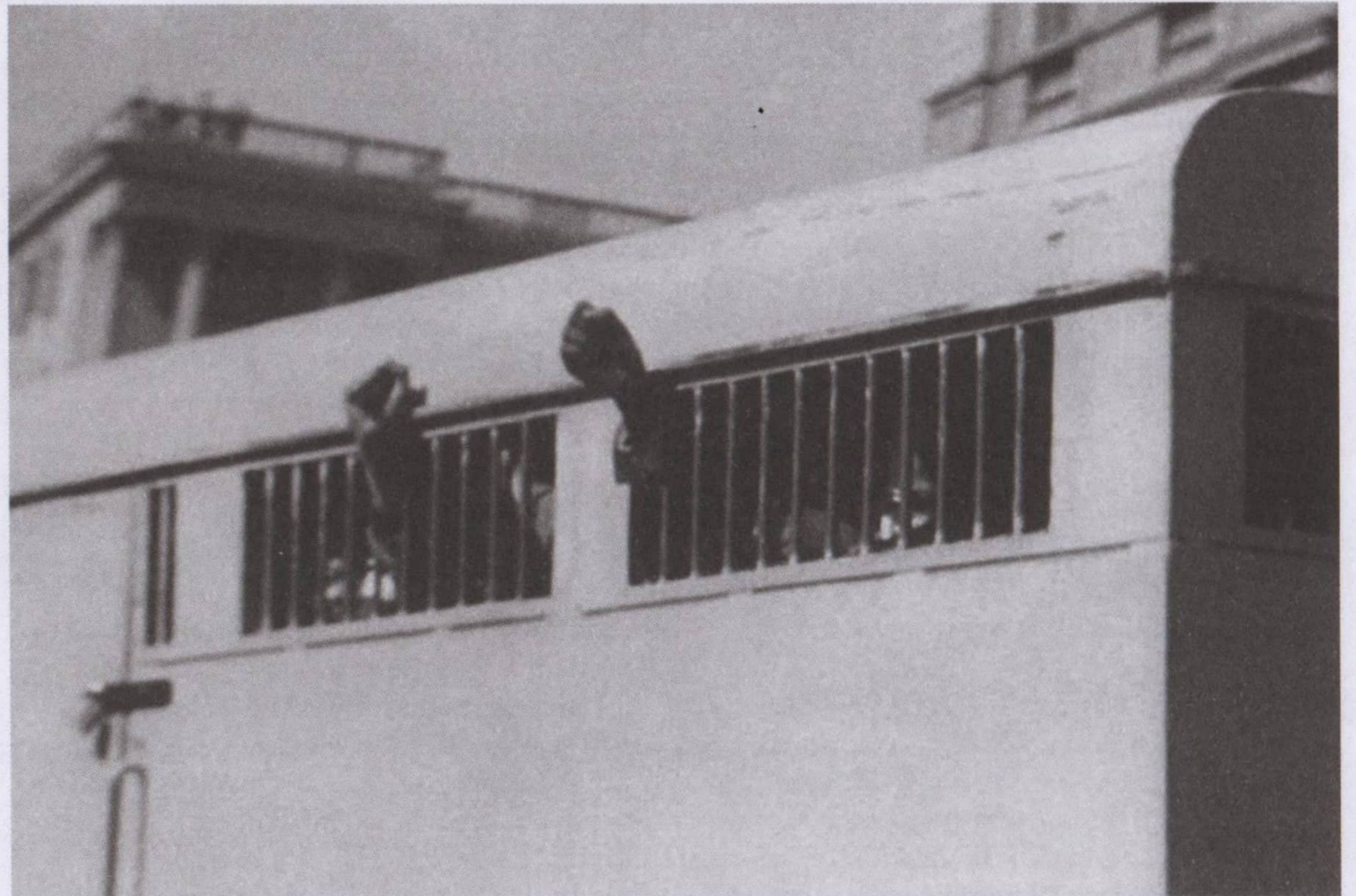
Above, those sentenced to life imprisonment, among them ANC leader Nelson Mandela, leave the Palace of Justice in Pretoria on 16th June 1964; below, protesters face police outside the court room where the Rivonia Trial took place.