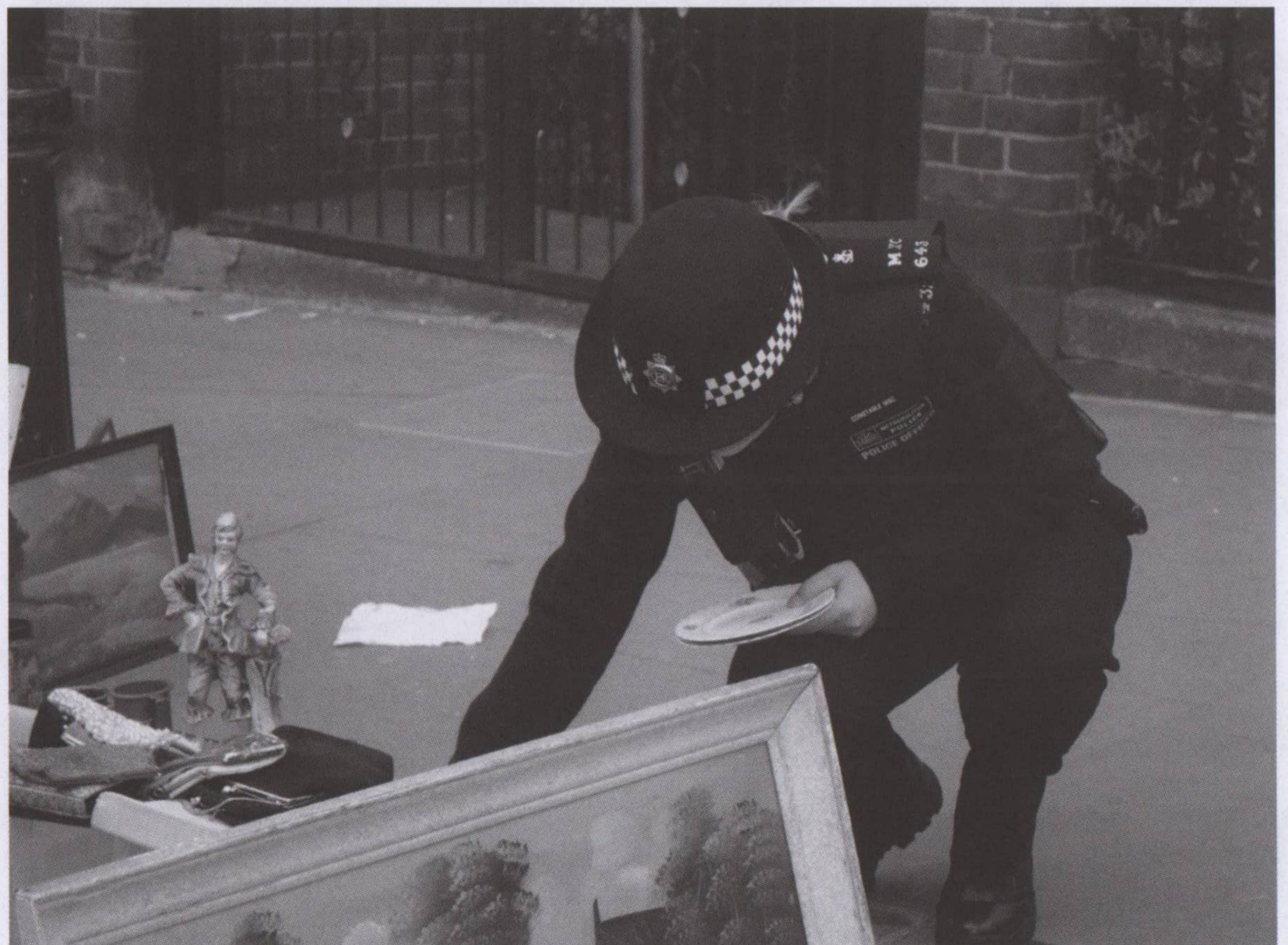
Artbeat special officer on patrol around London's Portobello Market.

Critics of the scheme have pointed out, quite rightly, that this would deter certain groups of people from applying to the Metropolitan Police. Presumably they mean that the Met will fill up with chinless types who can afford to work for nothing in London for a year and a half. Protecting the rights of private property over people requires either payment or a strong identification with private property. The government are gambling on the latter if they neglect the former. Demonstrations in five to ten years' time could prove very interesting.