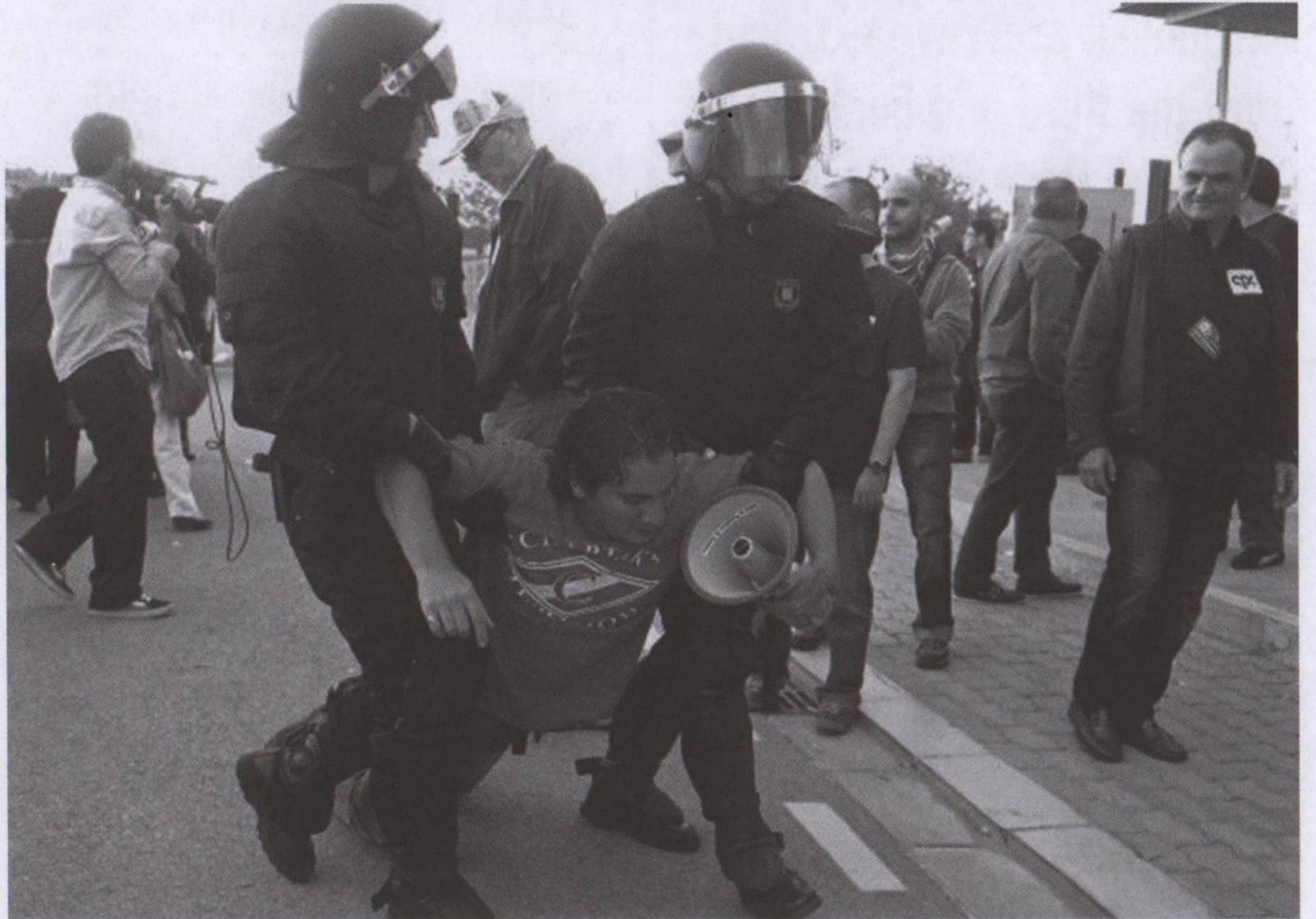
Police remove a worker blocking the road in Barcelona before the start of the general strike.

The Socialist government has tried to play down the event by claiming that most of Spain was "operating normally". But the ruling clique of Jose Luis Rodriguez Zapatero is facing growing public anger over the austerity measures announced in May this year. With a budget deficit of 11%,