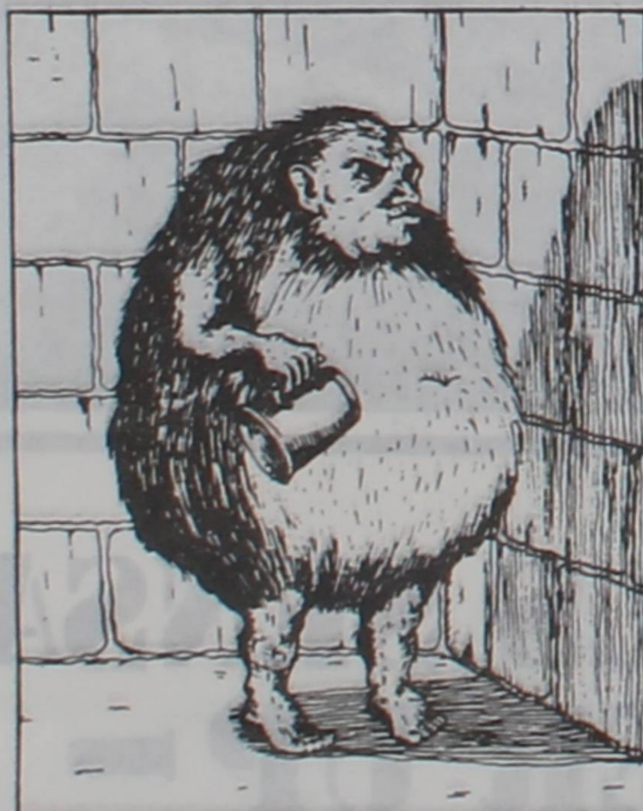
Original engraving of the horror of Glamis Castle by the pensioned off slater in Australia.