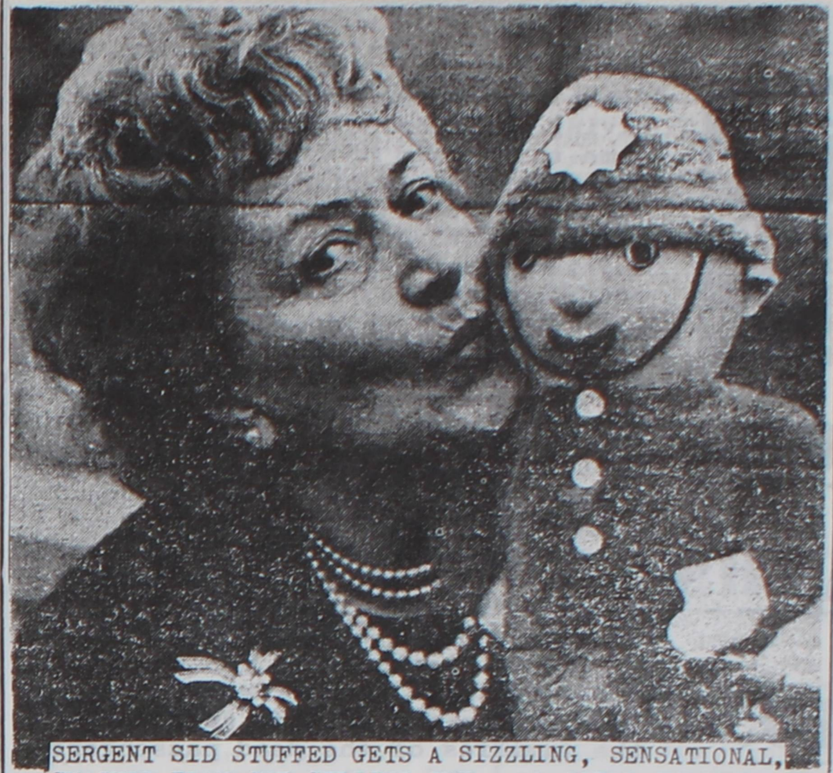
SERGEANT SID STUFFED GETS A SIZZLING, SENSATIONAL, SMACKER FROM SEX SELLING CYN....& STILL SURVIVES. OH SHIT !!!