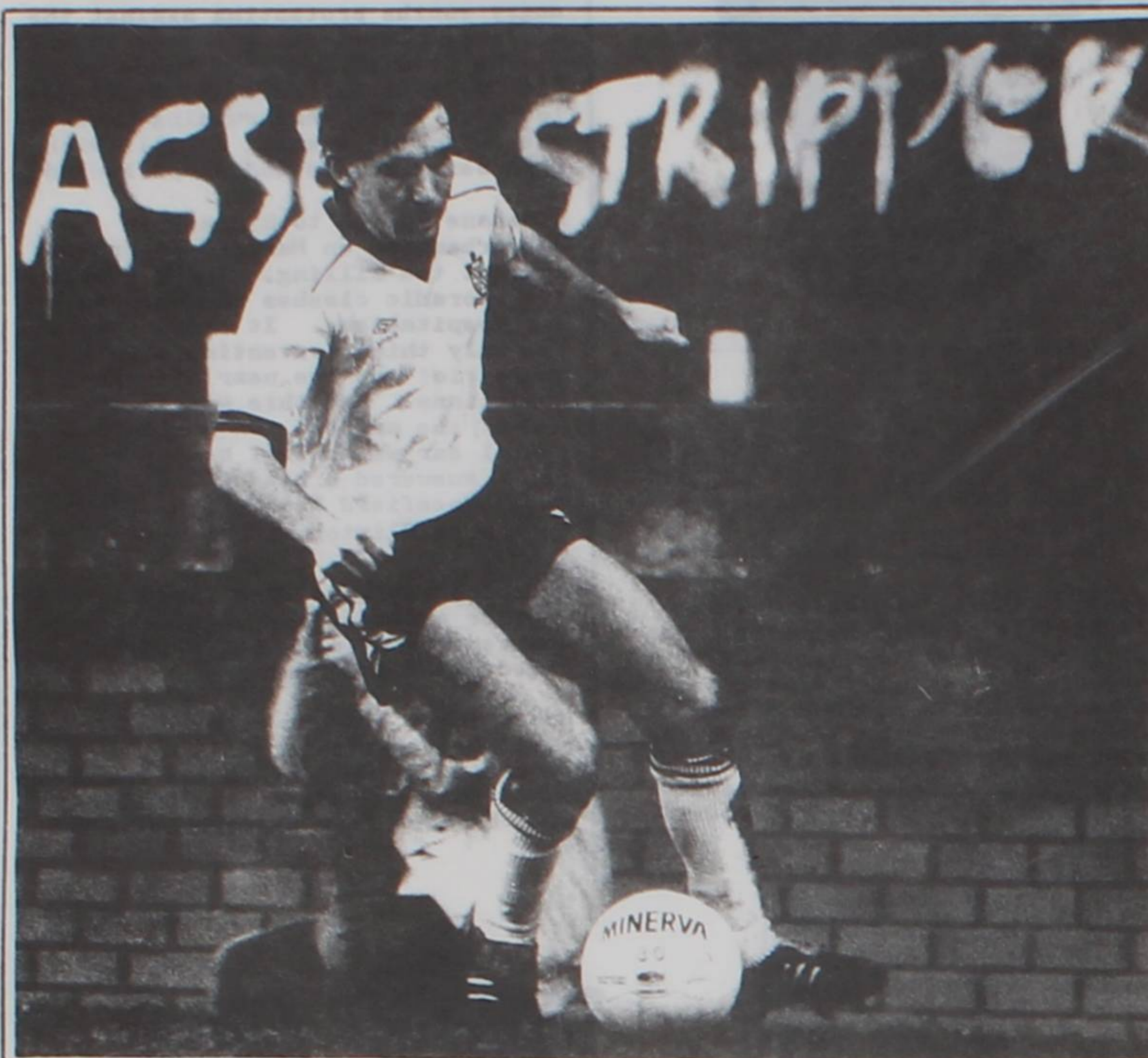
THE WRITINGS ON THE WALL..... the full message at Fulham reads "asset strippers are bastards".