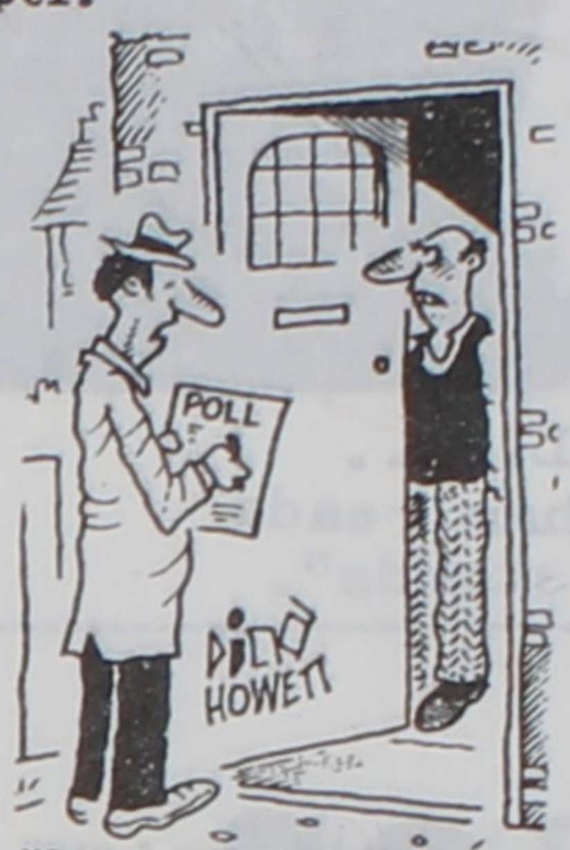
"Can I put you down as a 'Get stuffed!'?"

against their 'socialist' govts 'austerity' (cuts) policies. We will have to do the same under Labour. If Labour get elected expect a few more houses, 10p on your dole and a few more YTS jobs. And also expect Thatchers policies dressed up in Labours grey suit and tie with a little red rose in the lapel.