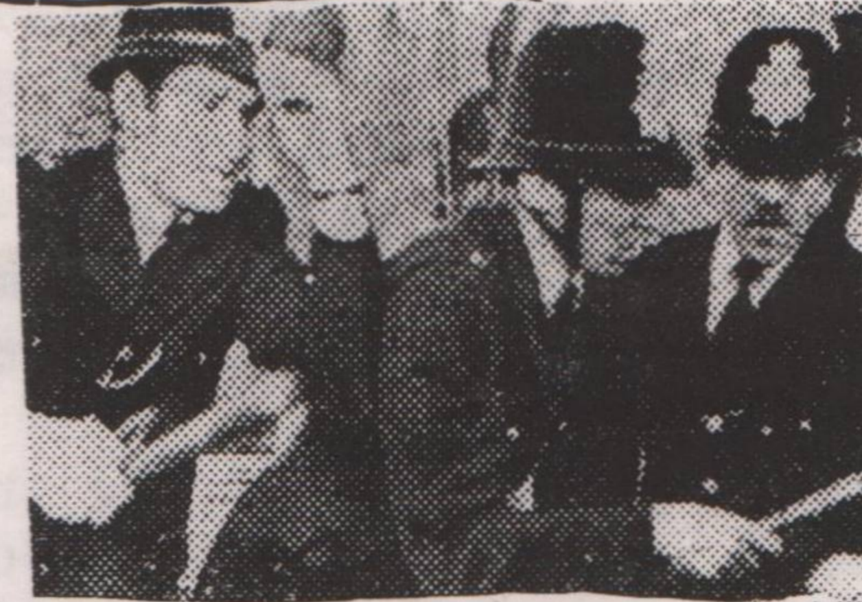
POLICE ATTACKS ON ANIMAL LIBERATION MARCHES, AS AT CARSHALTON ABOVE, ARE DESCRIBED AS "UNFORTUNATE" BY THE B.U.A.V.

Because the pacifists are seeing the collapse of their CND/Peace camps strategy as its impotence becomes obvious to their troops who they have led to the top of the hill and led down again as they did in the 60s. They fear a turn to violent action by those disillusioned with holding hands and singing. Similarly the bureaucrats of the BUAV fear the growing militancy of the animal liberation movement, the increased daring of its attacks on property and confrontations with the police. On the contrary we warmly welcome the increased ferocity of these attacks and will do our best to extend them into all areas of enemy held territory.