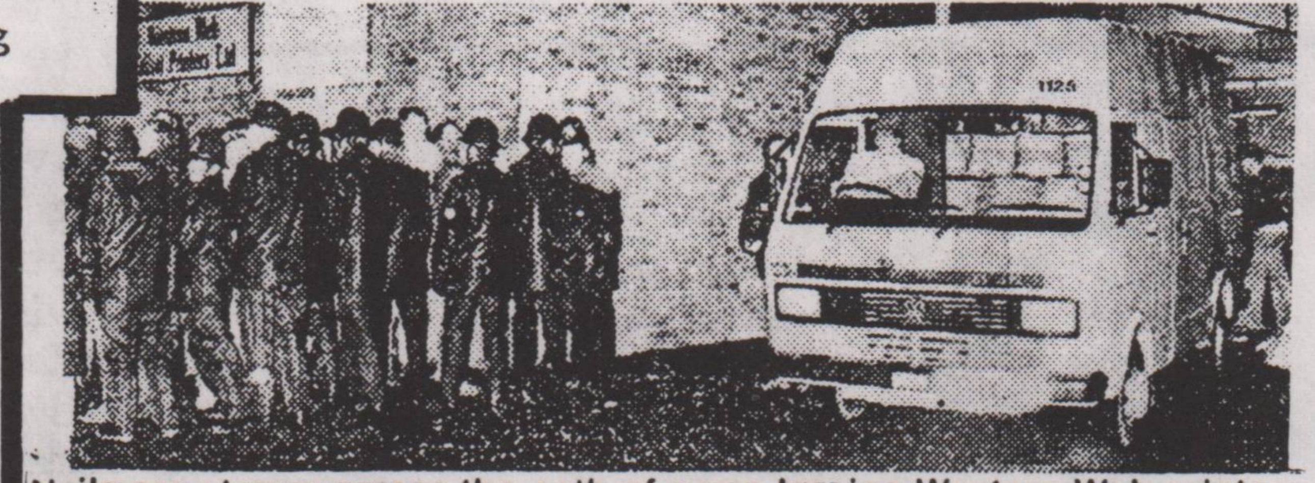
Nails are strewn across the path of a van leaving Western Web printers