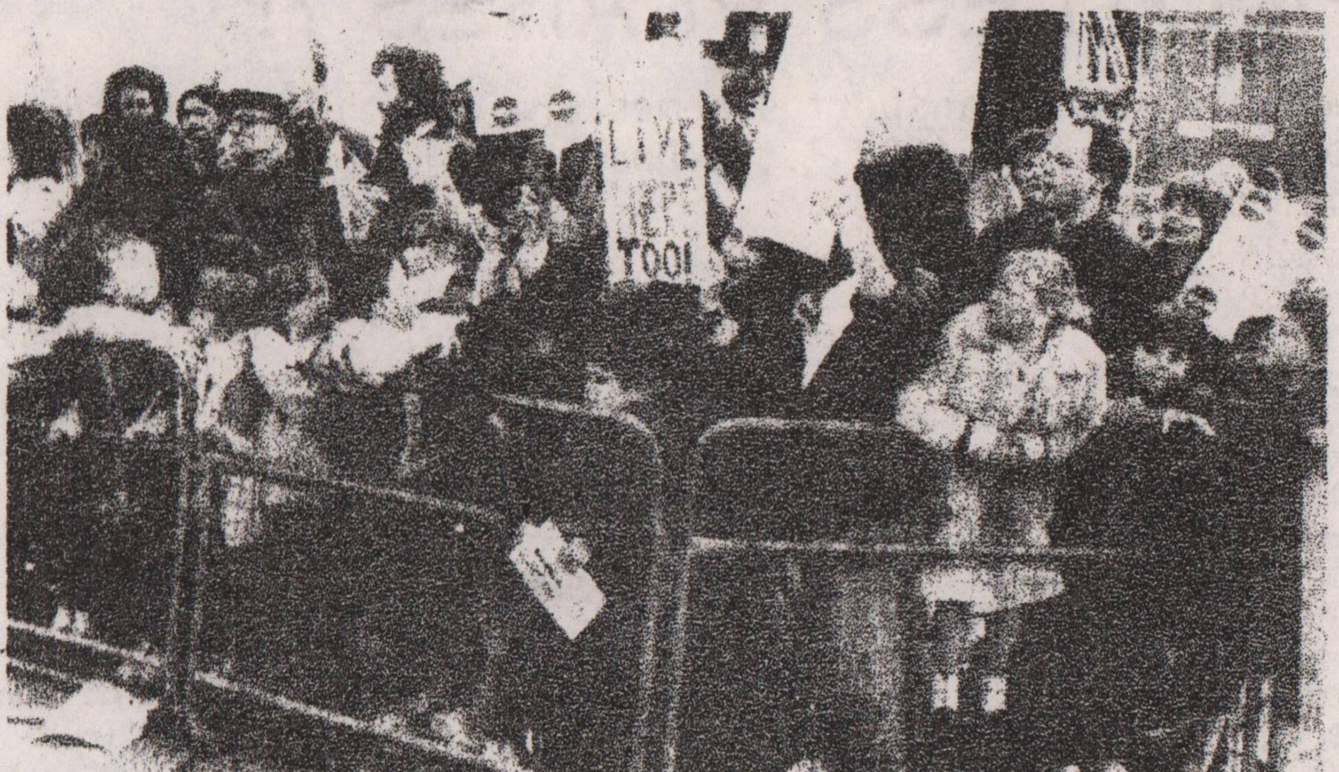
Waterlow protesters wait for the Prince.

whole block of 40 perfectly good flats. The Liberal council says this is to improve the environment "for the benefit of all the people who stay on the estate"; in other words, so the new wealthy residents can have a nice view.