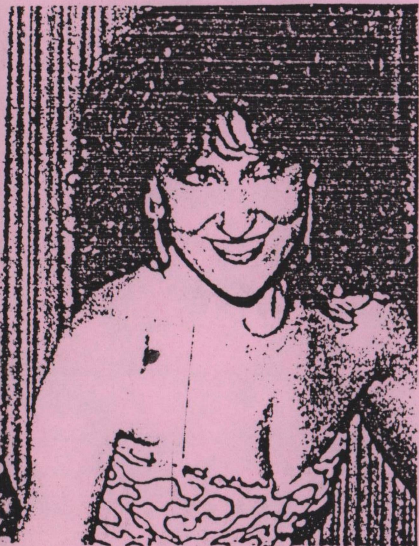
ANGIE GOBSMACKS YUPPIE!

EastEnders ANGIE landed a cracking right hook on some disgusting toffee-nosed Yuppie in WILMOTT-BROWN'S snotty wine bar the DAGMAR. In the next episode DIRTY DEN and ANGIE told WILMOTT-BROWN his sort weren't wanted in the East End because they were pushing up house prices and driving the true East Enders out. Angie followed up by telling Willmott-Brown to stop whining just because the East Enders were starting to fight back.