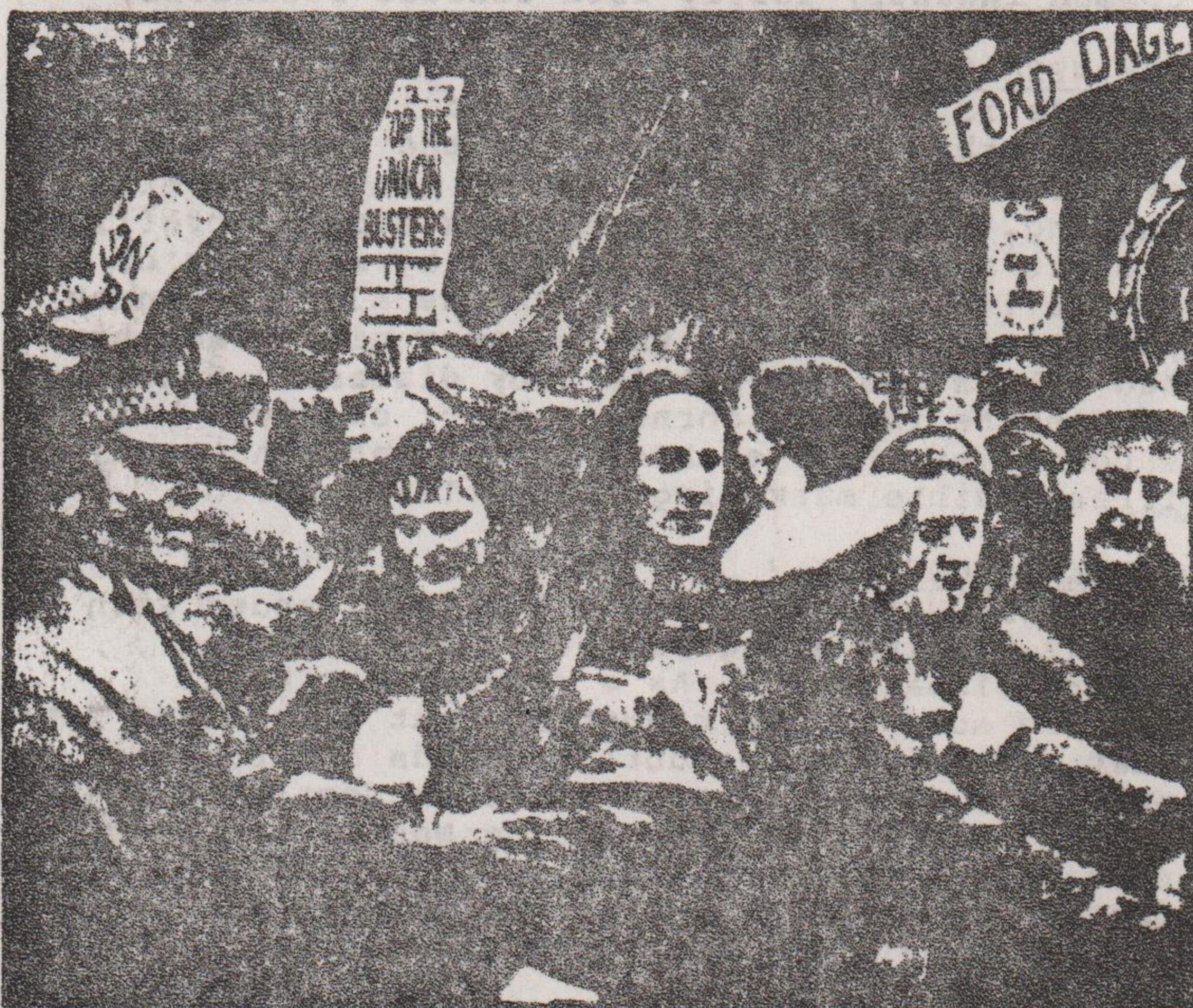
Police and demonstrators clashing outside the Timex factory in Dundee

Direct Action Movement-International Workers Association