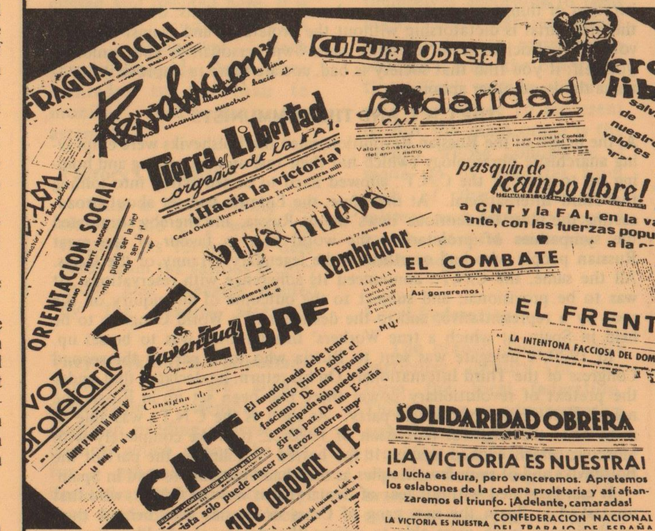
This is a sample of publications associated with the CNT and FAI from many cities and towns in Spain.

Resolutions can be adopted by acclamation if no dissentient voice is raised against them; but normally voting by a majority is required ('majority law'), or by proportional representation, dropping progressively a certain number of votes for every one thousand members represented.