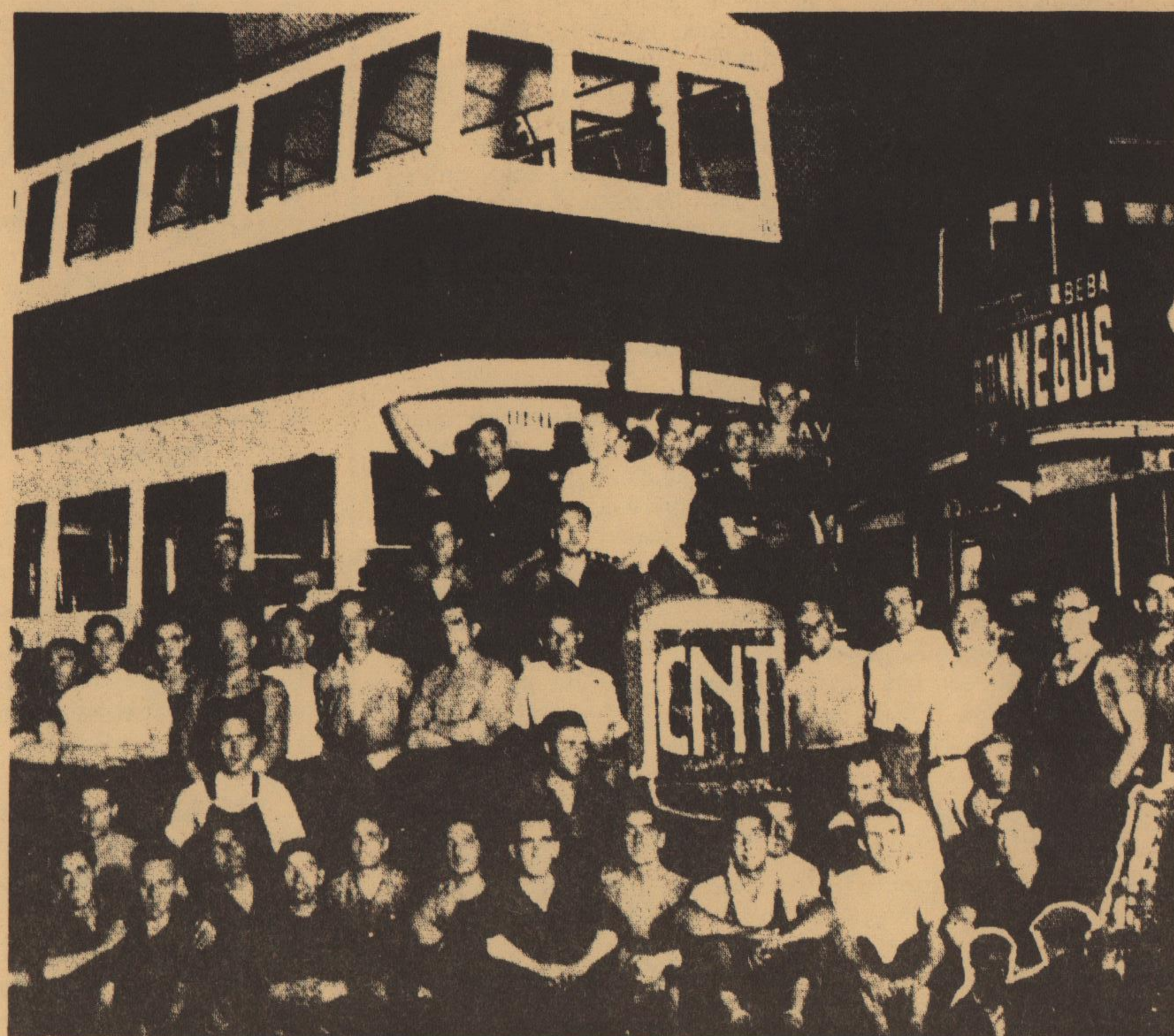
Above—The first bus built in the workshops of the collectivized General Autobus Company.

What then are the functions of delegates and committees if they haven't any power to make decisions. The function of committees is to carry out decisions taken at various assemblies, be they branch, local or regional. The Committees are also necessary for information processing, making sure that every section, branch or local syndicate knows the activities of every other section, branch or local syndicate. The Committee also see to money, papers and such matters.