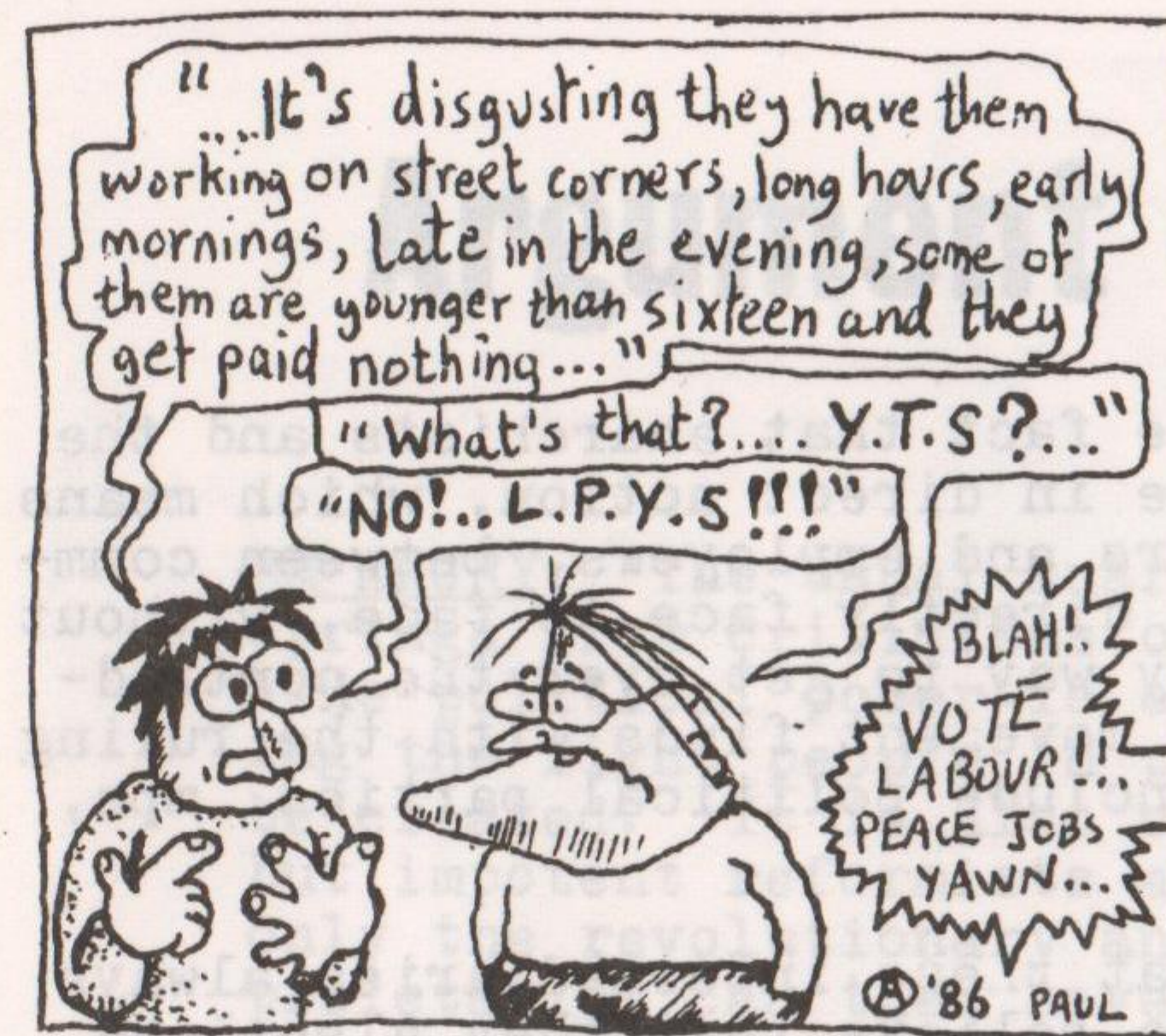
VOTE LABOUR AND STILL DIE HORRIBLY

Given the labour party's opposition to the police bill for instance, let's have a look at their past achievements in the field of law; the prevention of terrorism act giving backing to state terror; arming the police with riot equipment at, lewisham 1977 and southall where it was LABOUR'S police, not tory police, who murdered blair peach: strengthening cowboy units like the SPG. When in office the labour party has given the police every ounce of its support as they smash down those workers who fight back outside the cozy confines of their rigged publicity stunts. Are we meant to believe some miraculous change of heart has taken place since then? Or are they going to continue in the spirit of eric neffer when as riots routed the police in 1981 he said "Rioters and looters must be punished with all due severity." Kinnock and his chums (hattersley, willis etc.) went on television during the miners strike to condemn strikers and pickets who used force to resist the state. So loud was his phoney condemning of "all violence" one could even be fooled into thinking he is a pacifist, but of course in reality kinnock is a firm supporter of violence. He supports the military violence of NATO, he supports the violence of the british army and he supports the violence of the police. A labour government will mean more and more smiling social workers and more and more smiling "community" (riot) police.