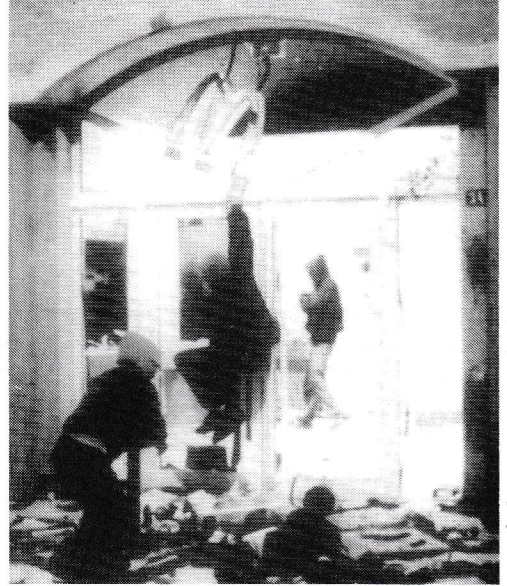
The working class district of Nørrebro, Copenhagen celebrated the New Year in style when shops and banks were attacked. The night's events culminated in the trashing of a recently opened McDonald's restaurant by about 400 first-footers.

Shell means Hell The run-up to the trial of Ken Saro-Wiwa, a major figure in the Ogoni people's fight against Shell's devastation of their land in Rivers State, has seen the leaking of official documents proving that the military government destroyed many villages, torturing and murdering up to 1,800 people. They also indicate that Shell paid for the military operation. 300,000 Ogoni people have protested at the destruction of farmland, oil spills, air pollution and water contamination caused by the government's and Shell's pursuit of profit.