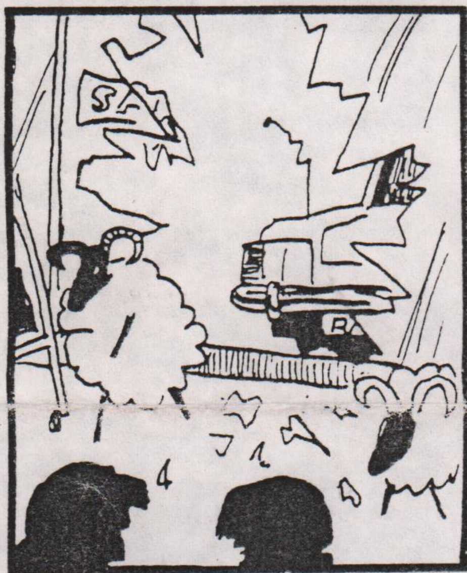
It's those ram-raiders again

The police really want to see ramraiders sent down. The local Special Patrol Group unit are totally overwhelmed by the scale of the ramraiders operations. Other police forces are said to be shitting themselves with the prospect of this craze catching on nationally. The working class will always find solutions to poverty. Let's face it, thieving is the only way we can get these modern goods, short of paying extortionate prices in rich bastard