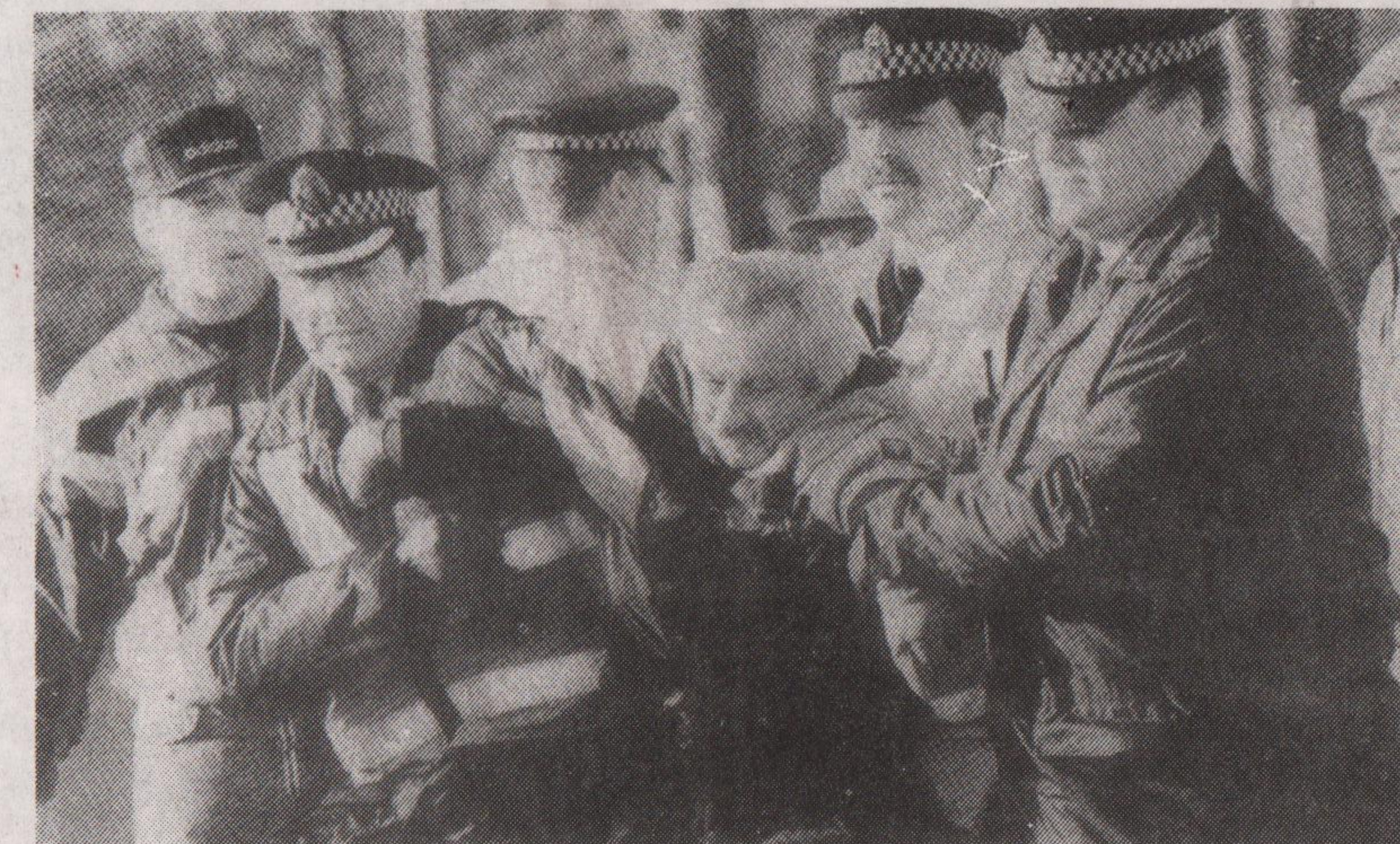
NOW: arrests on the Timex picket line in Dundee