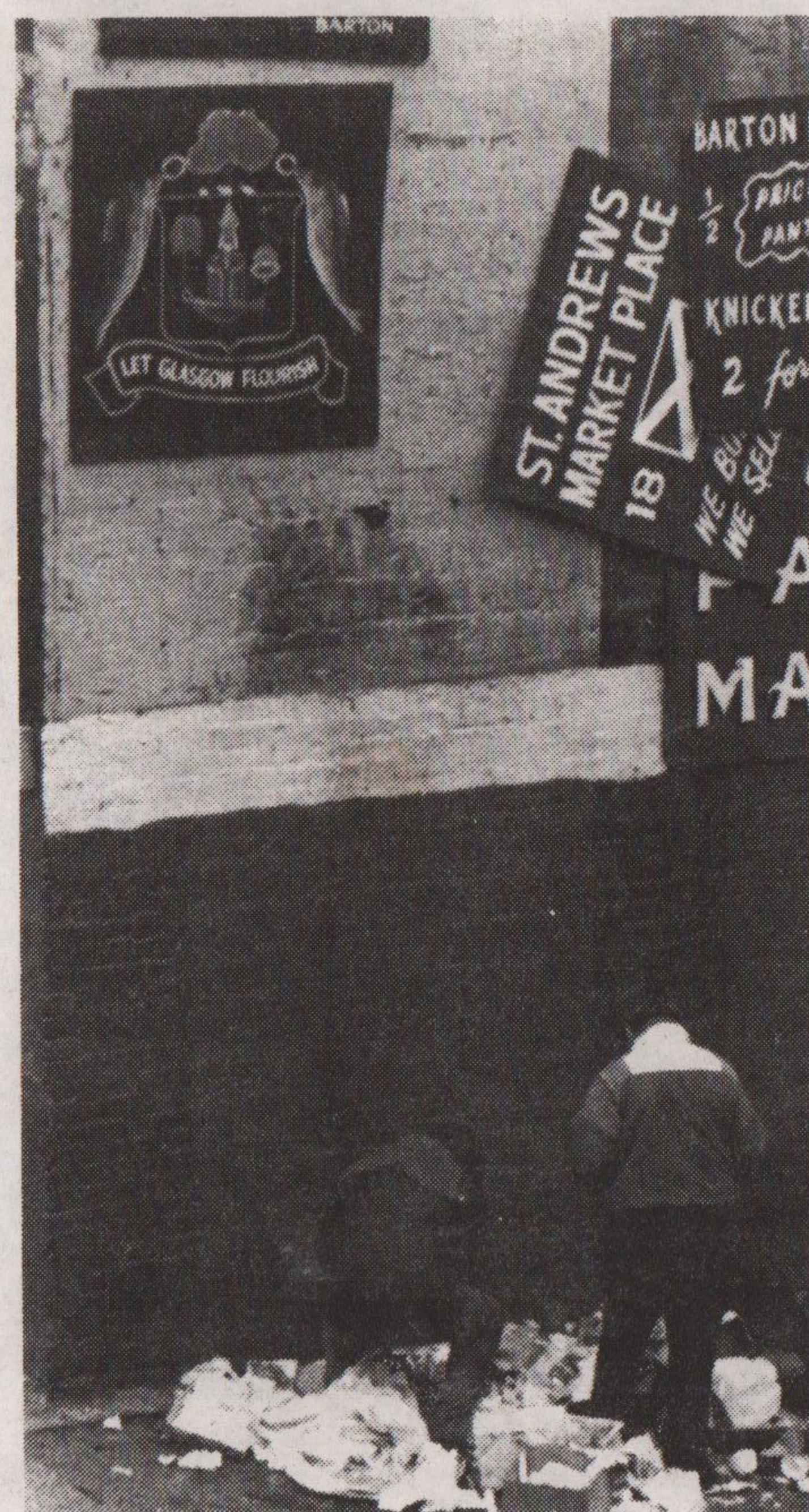
● Let Glasgow flourish... by rooting in the middens.

● from a leaflet distributed on the streets of Glasgow