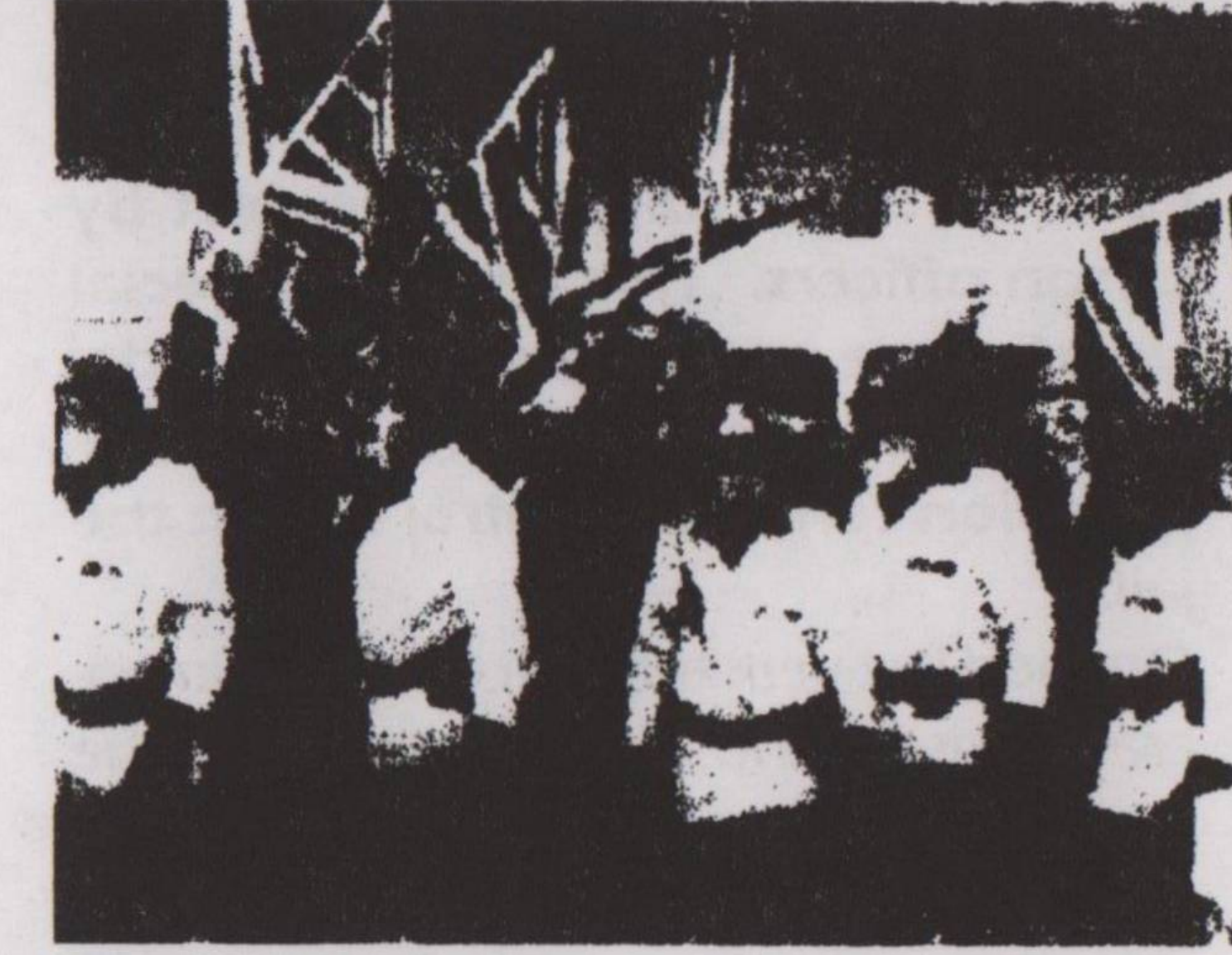
Fascist thugs protected by racist thugs in Dover this January.

http://www.canterbury.u-net.com/ Dover.html