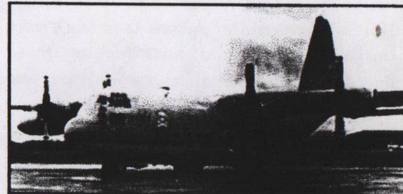
It's not Aer Lingus!

Meanwhile observers who had reached the main terminal building saw a Hercules US military plane land, and quickly take off again without re-fueling, presumably