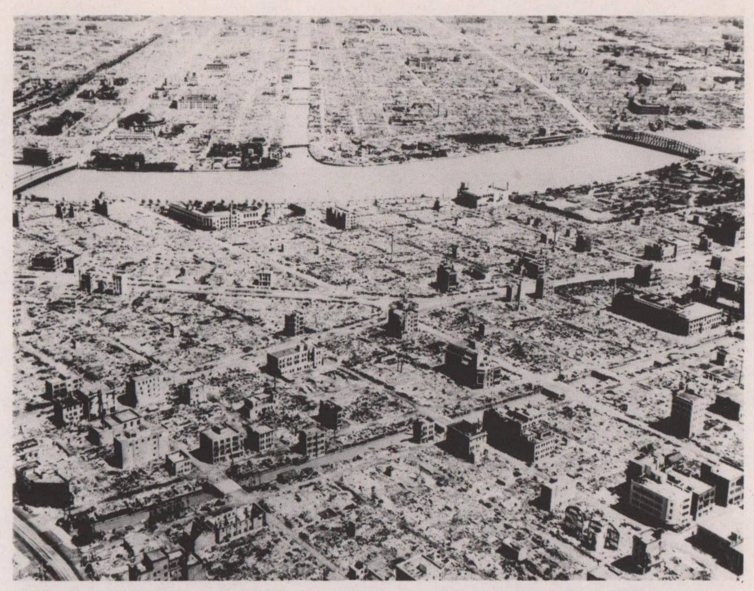
An aerial view of the industrial section of Tokyo, along the Sumida River. Saturation bombing left only modern steel and concrete structures intact.