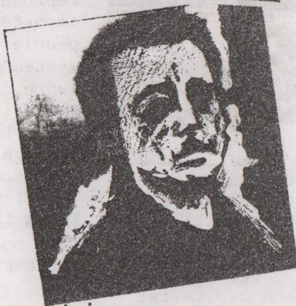
A PICTURE OF PETER TATCHELL.

FOR ANARCHIST BOOKS, MAGS, T-SHIRTS, POSTERS, SQUATTING ADVICE - the 121 CENTRE, 121 RAILTON RD, BRIXTON, LONDON SE24. tel 071 2746655. open Wed/Thurs/Sat 1-5, Friday 2-5, Sunday 3-5.