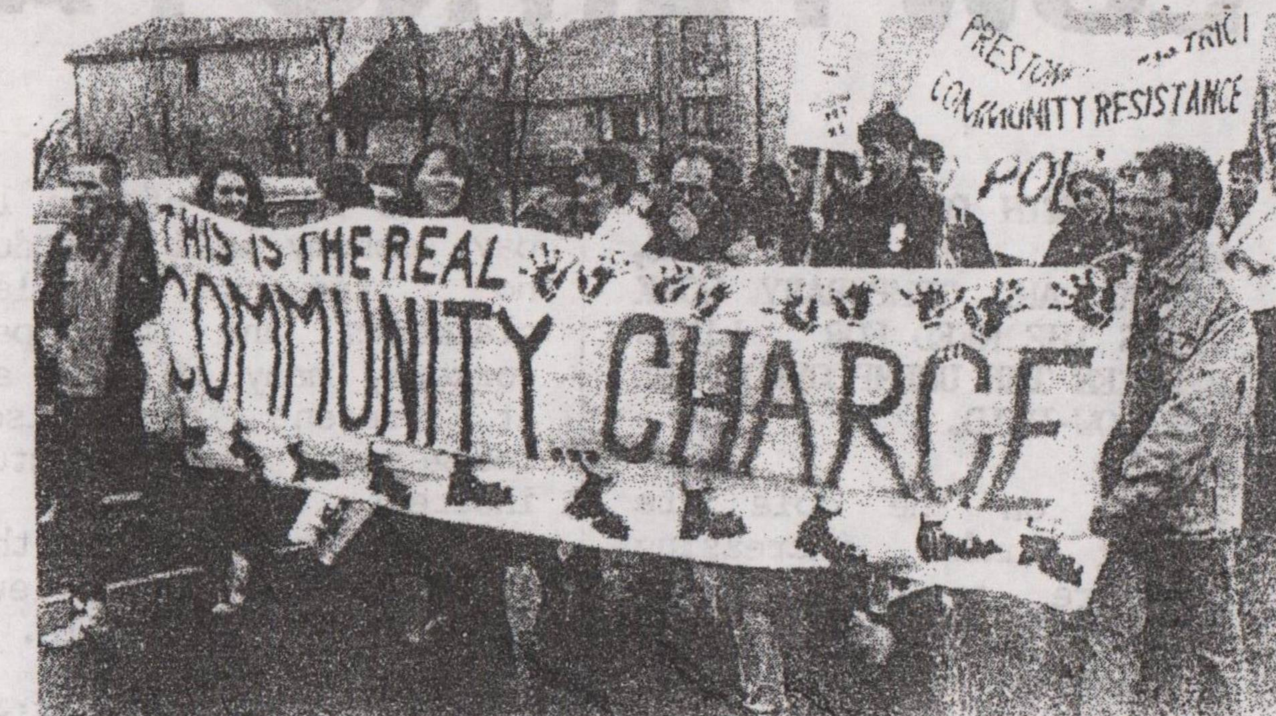
Marchers in Scotland ignoring media disinformation.

* The issue of payment books is only half completed.