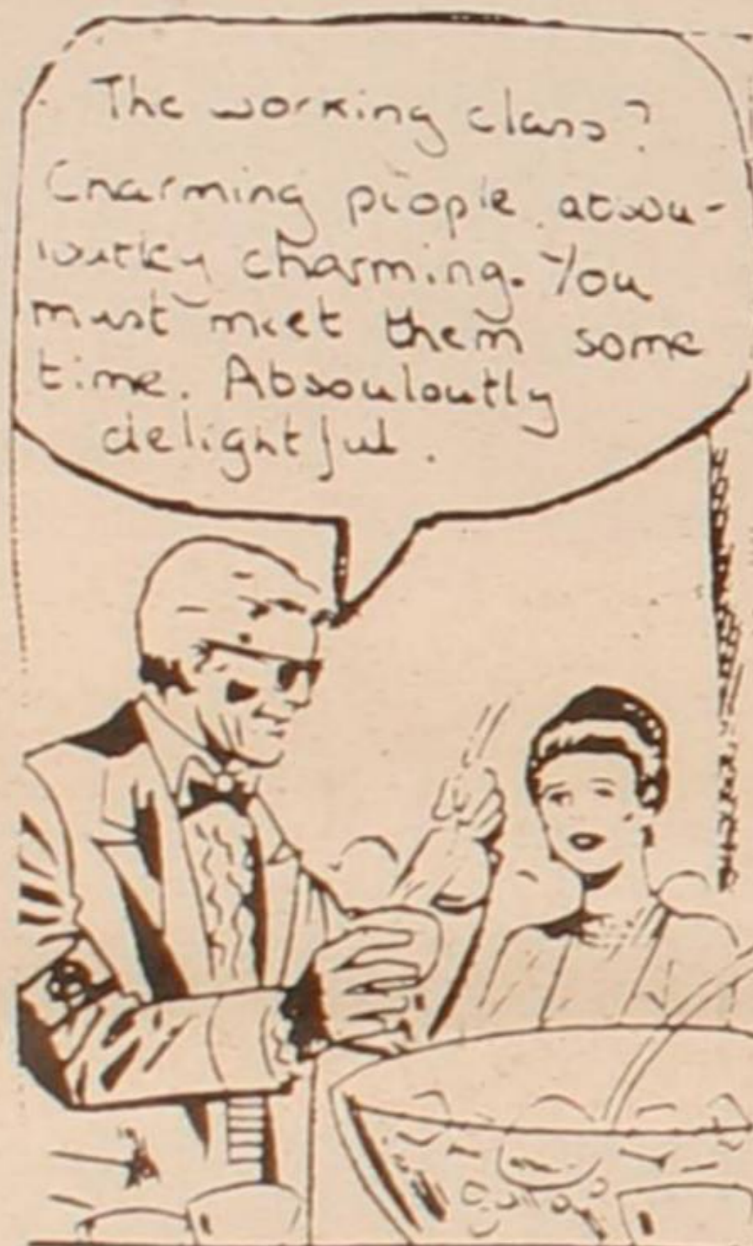
Does the C.P. control your trades council?

The strategy of building Libertarian Working Class organisations whenever possible is necessary. If workers can begin to burst the chains of reformist organisation and are looking for better ways, the examples will be there.