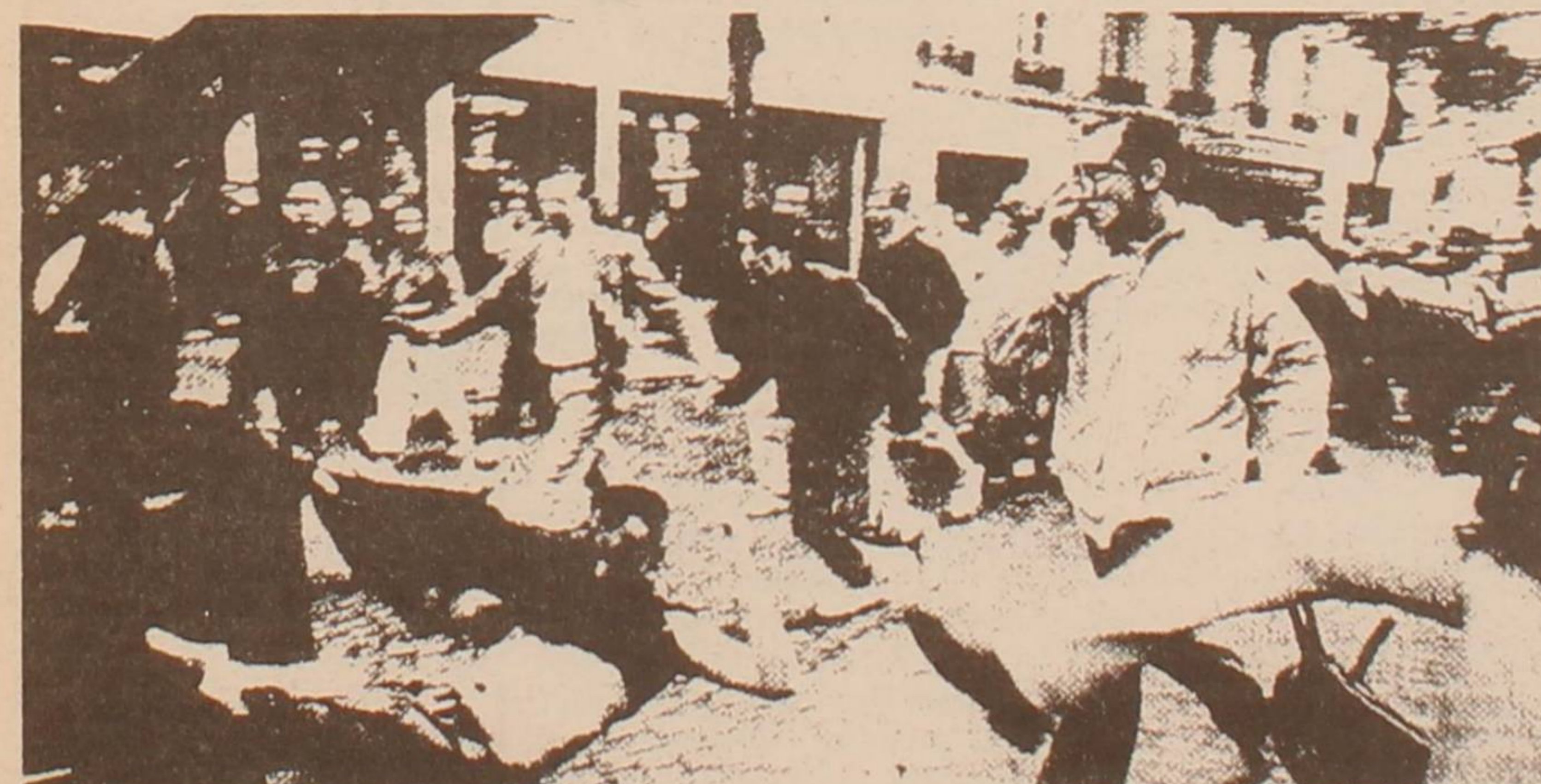
French Jewish youths hit back against Le Pen's fascists

Distribution note. There have also been changes to the distribution of DA. This shouldn't have affected many people but if it did please let us know.