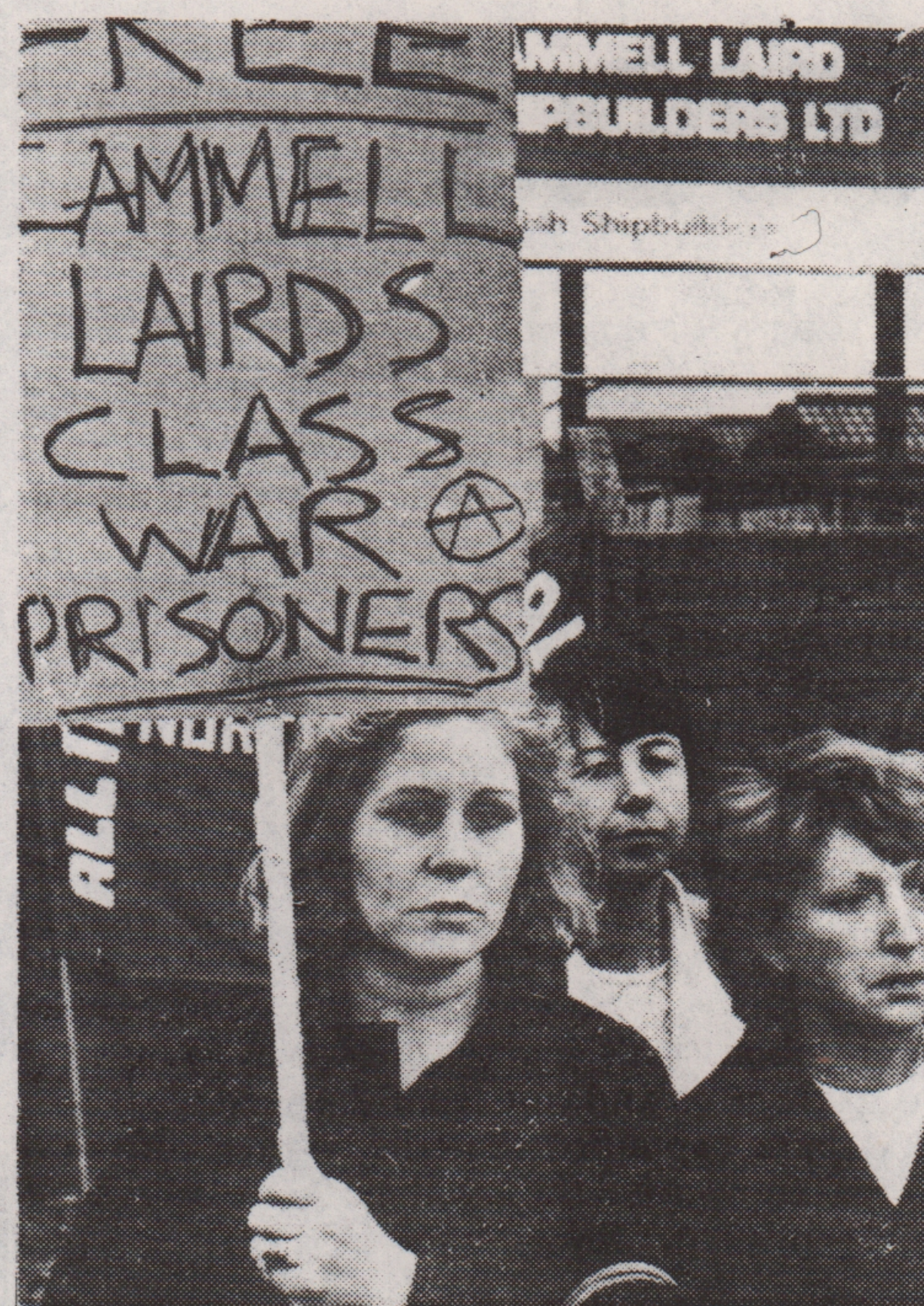
MASS picket by wives and supporters at Cammell Laird following the imprisonment of the occupiers. They spent one month in prison.

"Voice of the Majority", "Voice of the Moderates", or "Voice of the Morons"? is the title of one of the 'return to work' groups which have appeared to NCB applause. Promising a "massive return to work" (as yet a non-event!) they join the Tory darling 'Silver Birch' etc who keep working (with bonuses) and appeal for money to take up court cases against the NUM. In London ads have appeared in local press and leaflets are reported to have been distributed in select areas, under the name, "Return to Work Campaign".