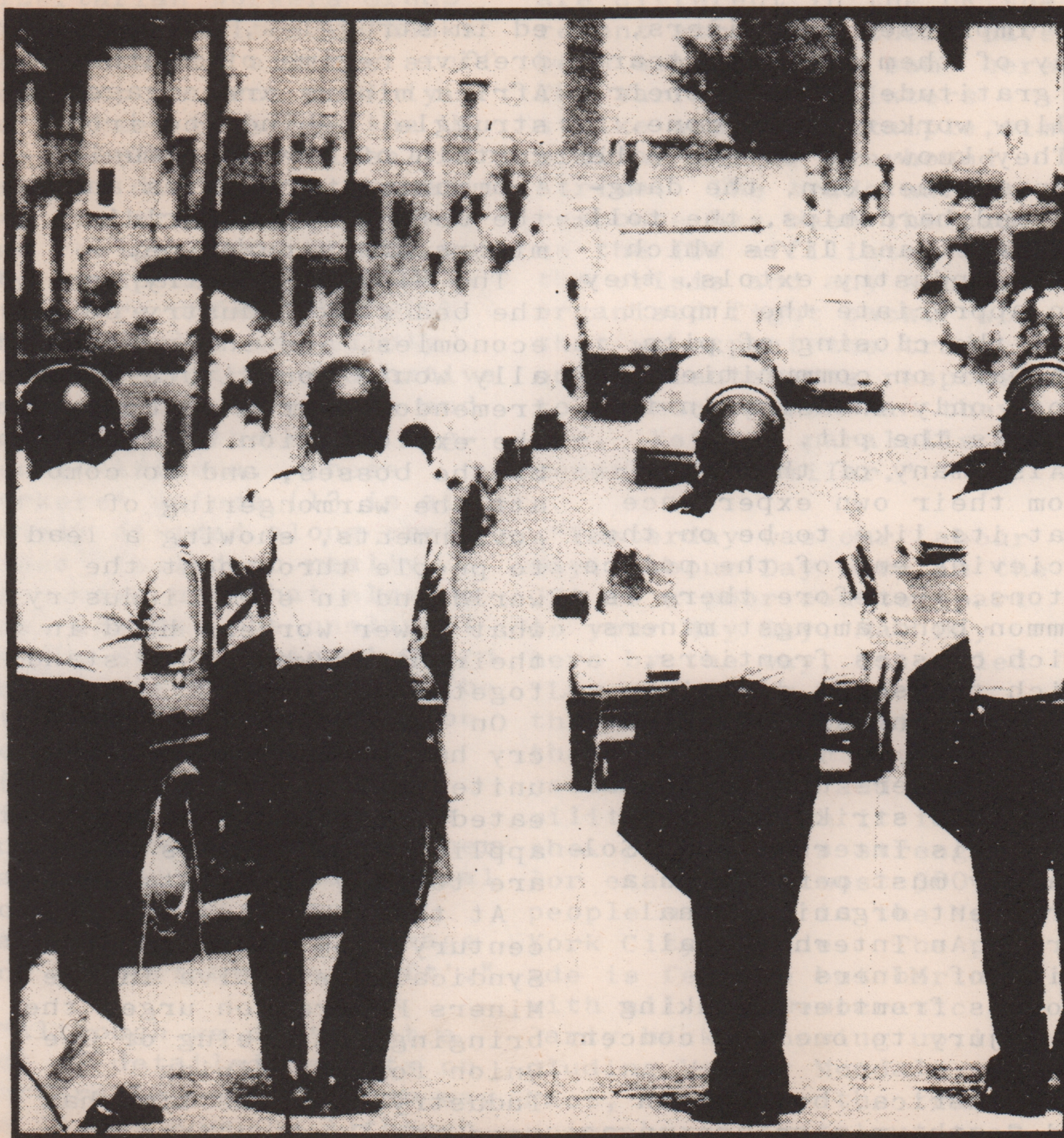
High Noon in Armthorpe, August 22nd

the only charge against them. A similar law has been used in Ayrshire. 87 strikers were arrested for picketing the home of a scab and may be prosecuted under an 1875 Act of Parliament which makes it an offence to "beset a house".