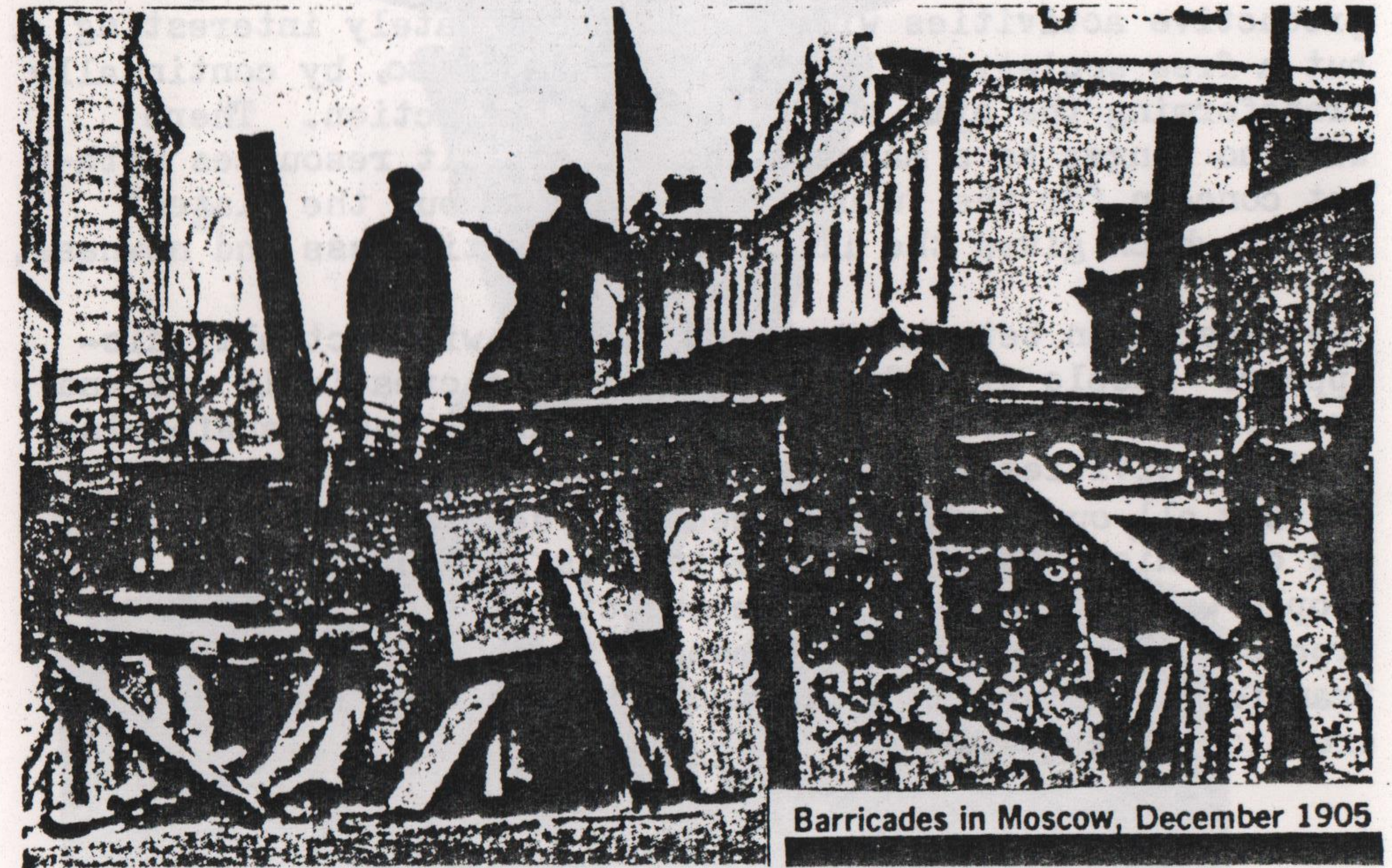
Barricades in Moscow, December 1905

It is a struggle to spread the revolution to all parts of the world, to remove pockets of resistance, to guard against sabotage, and to destroy all remnants of capitalist organisation - that is the structures of the state, parliament, the unions and the various parties which claim to represent the working class.