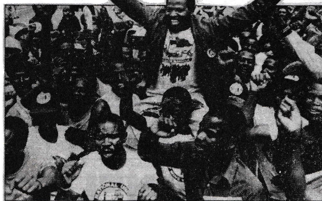
THE SPIRIT OF DEFIANCE DESPITE THE ODDS

No-one was hurt in the attacks and the total damage done was over £11 million! Watch out, Laura!