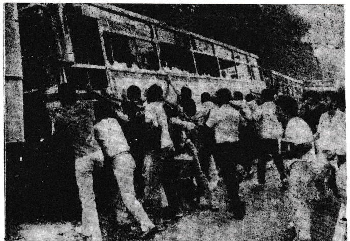
BEFORE THE STATE CLAMP DOWN IN SEPTEMBER

Fierce battles flared on 3rd September in which one worker was killed. Strikers used bulldozers and dumpers against Police lines.