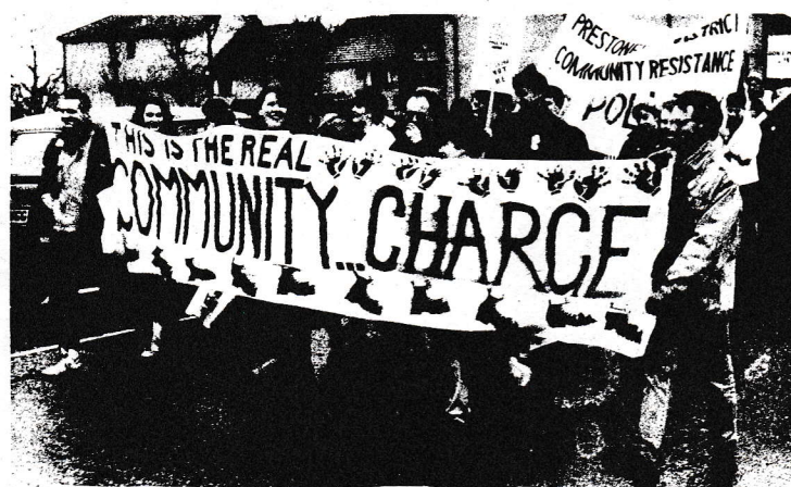
18 March, Glasgow: 15,000 demonstrate for non-payment