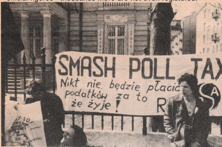
31 March Poland: 40 demonstrators picket the British Embassy in Warsaw to protest against the poll tax. The demo was organised by the anarchist group RSA.

In Scotland - where the tax was introduced in April 1989 - warrants for last year's bills are being issued against 800,000 non-payers, over 21% of those registered. More than 750,000 have not paid a penny of this year's poll tax. And these are the official figures - thousands more are not even registered.