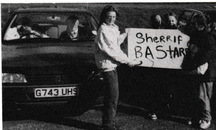
Local kids join anti-eviction protest in Moredun, Edinburgh.

*****There have been 3,000 successful appeals against Income Support arrestments in Strathclyde