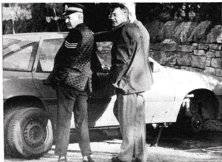
Sheriff officers operating in Dalkeith, Lothian in early February return from lunch to find their car tyres mysteriously deflated!