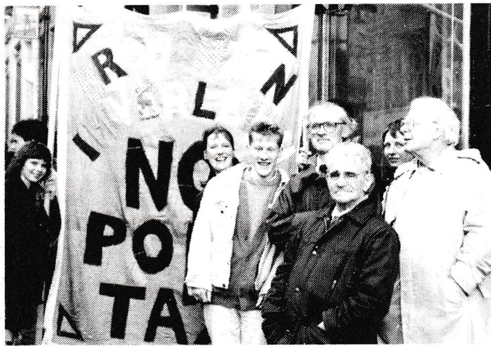
300 anti-poll tax protestors filled Jeffrey St., Edinburgh on 7 March, and successfully stopped a poinding.