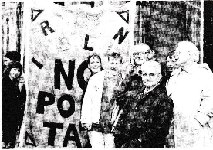
300 anti-poll tax protestors filled Jeffrey St., Edinburgh on 7 March, and successfully stopped a poiding.