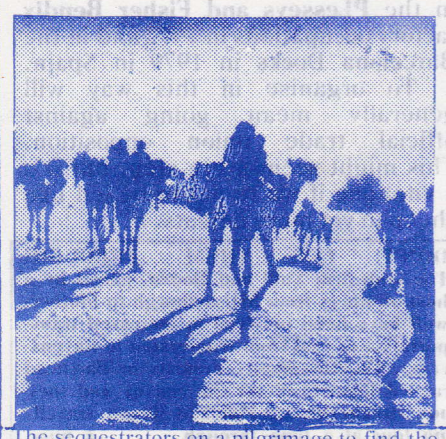
The sequestrators on a pilgrimage to find the missing Union funds. They'll go to great lengths to track the last penny down!