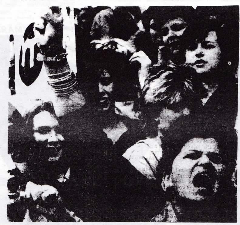
Over 3,000 school students went on the demonstration in Cardiff