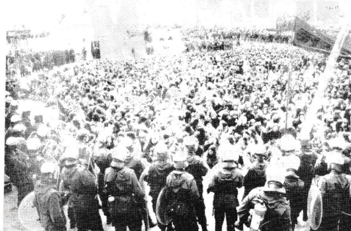
Demonstrators being removed by the police.