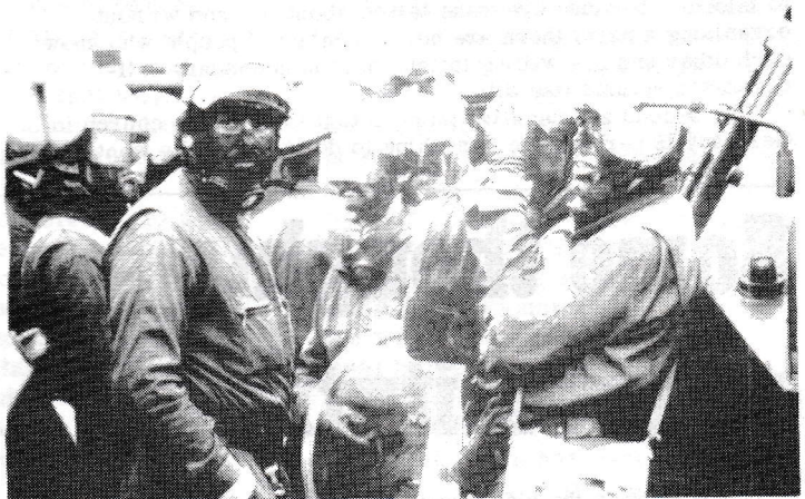
The lads pause for a breather.

At 11.04 am the removal of the people began. The first rows of demonstrators, sitting with linked arms were immediately beaten with truncheons. Despite this nobody struck back, and most of these people were beaten or dragged away, many by the hair. The people in the rows behind were shouting, singing, and weeping tears of powerlessness and anger.