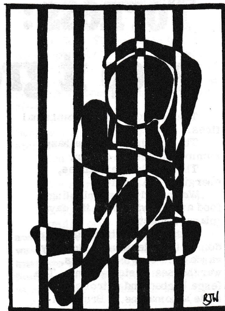
Graphic taken from BREAKOUT

The possibility that British prisons are about to experience attempts to establish a prisoners' union is made more likely by the signed document from Parkhurst. Despite the fact that the British