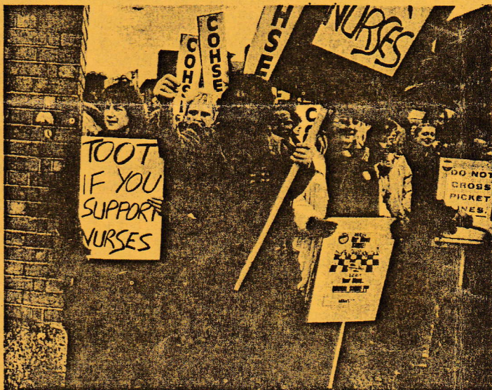
London, where Nupe and Cohse members mounted a 24-hour picket, seek the support of passing motorists.

Night shift workers at Dagenham walked out anyway, returning on Wednesday 3rd to vote. The deal was rejected. The workers position is strong as all Ford engines for Europe are made in the U.K. and company stocks are low.